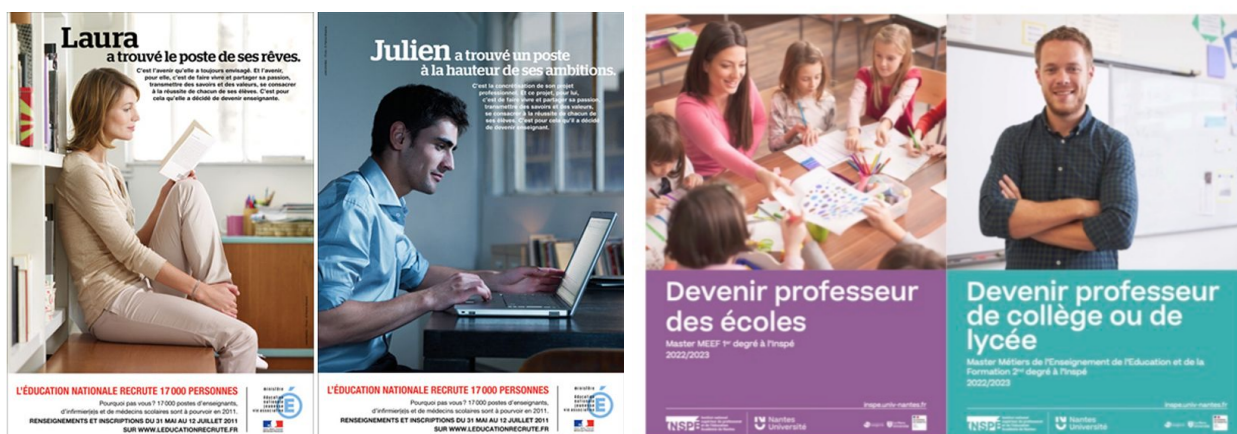
Fig. 2. Left: Posters of a teacher recruitment campaign by MEN in 2011 Right: similar campaign by INSPE in 2013.