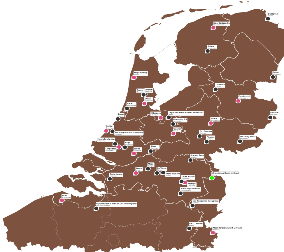
Figure 1 : Map of the 44 member institutes of the Korsakoff Knowledge Centre in the Netherlands and Belgium (Flanders).

The pink locations refer to the 12 regional expertise centres for long-term care and the two centres with a special expertise status for long-term care (Atlant in Beekbergen and Slingsedael in Rotterdam). The green location indicates the Centre of Excellence for Korsakoff and Alcohol-related Disorders at Vincent van Gogh Institute for Psychiatry that meets the criteria for top clinical tertiary mental health care, certified by the Foundation for Top Clinical Mental Health Care (TopGGZ).