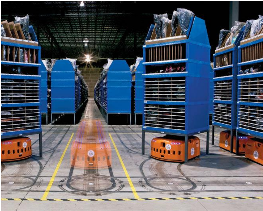
Illustration 6. The ballet of Kiva robots