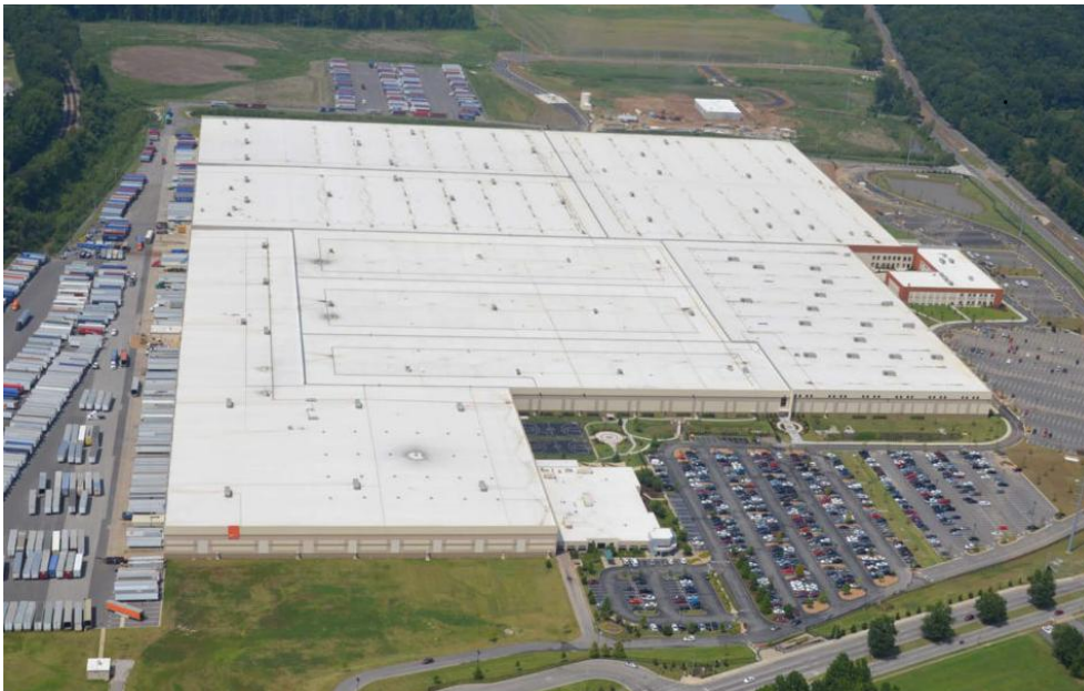
Illustration 5. Distribution center of Nike in Memphis

warehouse serves as a showcase of flow optimization and management—a feat of engineering aimed at maximizing efficiency and minimizing friction. Chua et al. (2018) implicitly convey this idea, framing logistics as a matter of calculative rationality. While primarily designed for practical purposes, warehouses also bear a cultural imprint. They symbolize the contemporary era of globalization, where consumption and efficiency dominate. Their sheer scale often leaves visitors, particularly students, in awe, while their symmetry reassures, and their precision fascinates. In many ways, these structures are material reflections of the consumerist values of neoliberalism. At the same time, they encapsulate the environmental challenges of our era, urging us to rethink humanity's relationship with space and resources.