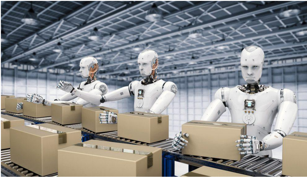
Illustration 3. Towards “humanized” logistics