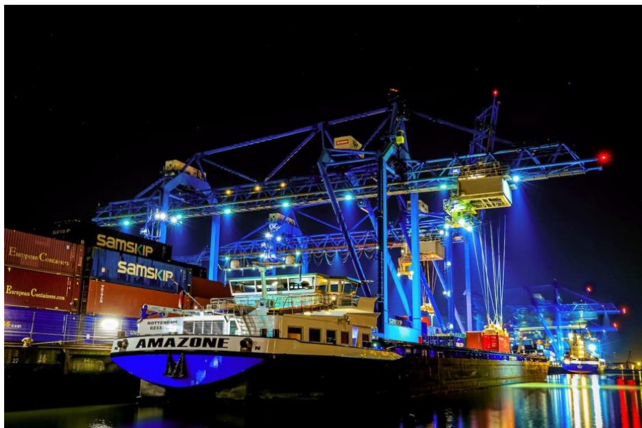
Illustration 2. Light shows in the Port of Rotterdam

Finally, logistics reveals an aesthetic of interconnection, where every element of a supply chain is both autonomous and interdependent. Illustration 2 exemplifies this archetype, featuring a light play reminiscent of a rock concert. A truck linking a factory to a distribution center becomes a pivotal piece in a much larger puzzle. The global web of connections, vividly portrayed through flow maps or data visualizations, embodies a systemic beauty in which each trajectory contributes to a greater harmony. This choreography of flows transcends the individual scale, evolving into a collective masterpiece rooted in interoperability (Dalmolen et al. , 2015)—a symbolic representation of globalization and human interdependence. Logistics underscores not only the efficiency of its systems but also their remarkable ability to adapt to contemporary challenges, including economic, humanitarian, and environmental crises. It reflects human aspirations for collaboration and innovation, emphasizing the critical importance of a responsible approach to resource management. Ultimately, logistics showcases the resilience, creativity, and shared vision required to sustain an interconnected world, reminding us of the intricate beauty embedded in the movement of goods and ideas across the globe.