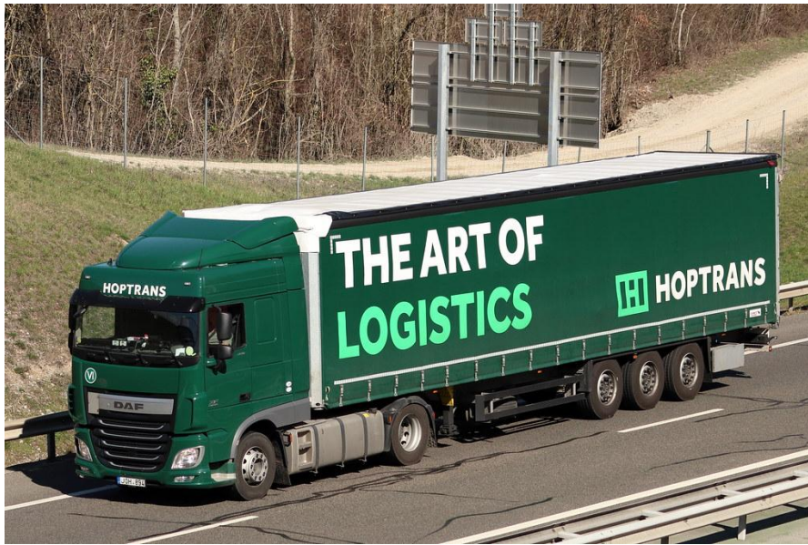
Illustration 4. Communicating logistics as art