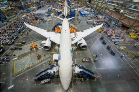
Figure 2: Boeing factory

exact location of the workers as the aircraft assembly line ever so slowly moves. This orchestra of various parts and workers ensure the products are assembled on time as well as uses barcode and RFID technology to ensure products are able to be Tracked and easily moved throughout the factory.