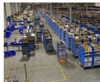
Figure 3:Kiva in warehouse