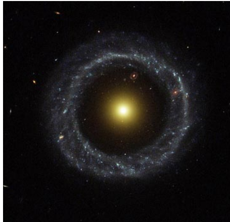
FIG. 2. Hoag galaxy

They could be the result of the convergence of a centripetal density wave, like the one suggested in the Hoag galaxy fig. 2.