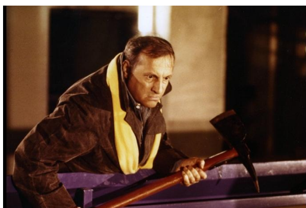
Figure 4 –Leader of the supporters, Rico (Michel Serrault) chases the referee with a fire axe

Referees) (UNAF), created in 1967 to defend referees' rights and working conditions, tackled the problem head on, announcing that the championship matches of February 25 th and 26 th , 1981, would be played without any referees 88 .