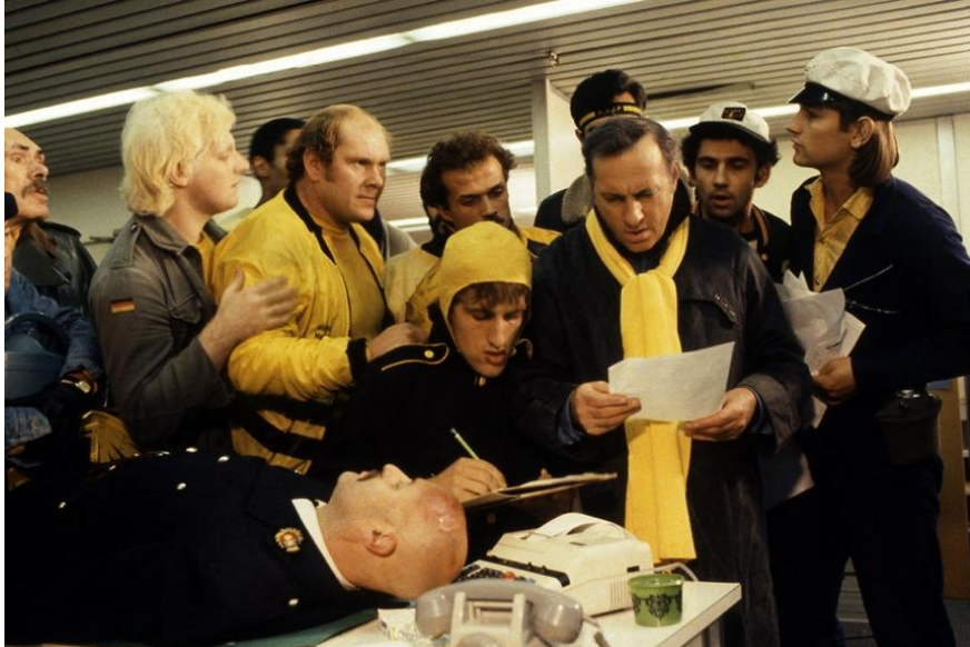
Figure 3 – The supporters look for the referee's address

In true “gunfight at the O.K. Corral” fashion, the manhunt comes to an end in an underground quarry, adding real aesthetic value to the tragedy. In addition to the pursuit between a car driven by the referee’s partner, as his arm is injured, and the bus driven by Rico, the slalom between the bulldozers gave the scene a “nighttime photogenicity” 69 , reminiscent of nocturnal meandering. While the dust settles temporarily as the partner stops the car on the edge of a precipice, with both protagonists believing they have lost their aggressor, Rico pushes them to their death by violently ramming their car. The element of surprise is achieved for the viewers who do not see it coming. This unexpected ending corresponds perfectly to the “criminal” categorization of the narrative for, as Dominique Kalifa wrote, crime rhymed in the collective imaginary with ‘a brutal, violent and major transgression, a vile and cowardly act that harms an individual’s physical integrity’ 70 . As for the police inspector arriving on the scene after the accident, he can only deplore this tragic outcome, adopting the position of a man who is completely disillusioned with the human race.