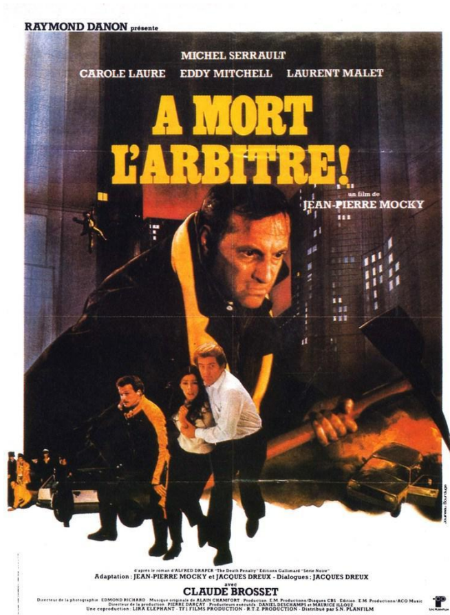
Figure 1 –Film poster for À mort l'arbitre ! by Jean-Pierre Mocky (1984)

The French press was mostly enthusiastic following the film's release, mentioning the mechanisms, abuses, and excesses of mob justice when it escapes from the stands. France Soir , for example, underlined the “pamphleteering” 27 aspect of the story. Le Matin spoke about a “vitriolic portrayal” 28 of football fans by the director. As for the newspaper Le Monde , it highlighted the “sarcastic vision” 29 of the film's production. While many media outlets celebrated the usual clichés regarding violence within the sporting world, a rare number of negative critics denounced the director's bias, in particular Gilles Le Morvan of L'Humanité who wrote, “At no point does the film rise above a minor news story, as tragic as it may be. The violence is completely gratuitous. It offers no insight whatsoever” 30 . He regretted the lack of a true character study for a better understanding of supporters' motives, in other words where they come from and who they really are.