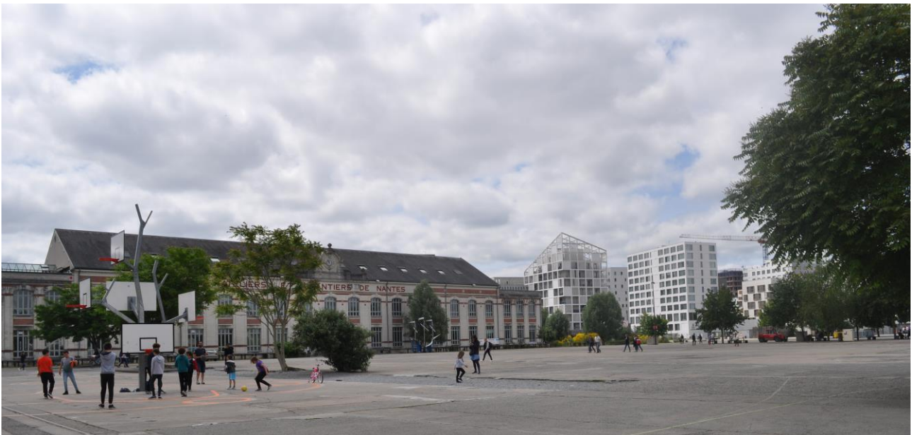
Figure 3. The transformation of the industrial urban landscape of the Ile-de-Nantes, reconverted industrial buildings, housing units and tertiary activities, Source: Varvara Toura, 2019