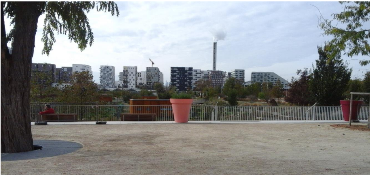
Figure 4. The transformation of the industrial urban landscape of the Docks-de-Seine, reconverted industrial buildings, industrial units and tertiary activities