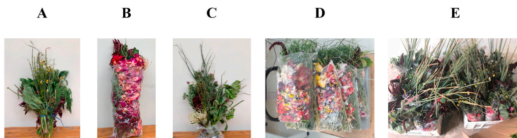
Fig. 3. Horchata plants collected at different markets: A) Loja (HL); B) Namarin (HN); C) Chuquiribamba (HC); D) Saraguro (HS); E) Quisquinchir (HQ).

The relative density of each oil was determined at 20 °C according to the international standard method AFNOR NF T 75–111 (ISO 279:1998). The refractive index was measured at 20 °C on an ABBE refractometer according to the AFNOR NF 75–112 (ISO 280:1998) international standard method. The specific rotation was determined on an automatic polarimeter Hanon P-810, according to the international standard ISO