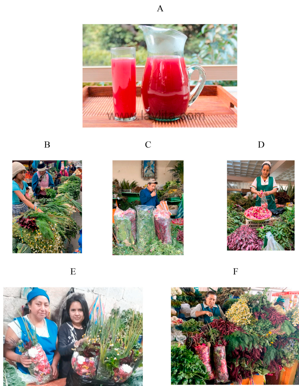
Fig. 1. A) Horchata lojana ; B–F) Horchateras at different Loja markets: B) La Tebaida market; C and F) Gran Colombia market; D) Centro Commercial market; E) Saraguro market.

Rios et al. (2017) have reported that horchata has been prepared in the Southern Ecuador since Colonial Times. According to some historians, horchata 's journey to Ecuador began in Spain where in the eighth century the Moors imported the plant Cyperus esculentus from the Arabic