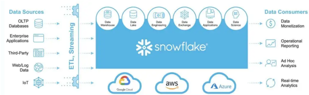
Figure A.1: Data pipeline with Snowflake technology as part of it.