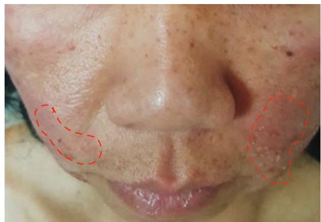
Fig. 2 Acne lesions after intensive washing of the skin (left cheek) versus mild cleansing (right cheek) in an adult female with mild acne

The objective of treatment in acne is not to kill C. acnes but rather to prevent or to treat dysbiosis, thus new ways of equilibrating the dysbiosis in acne have been investigated. One strategy relies on sucrose for selective augmentation of S. epidermidis fermentation over that of C. acnes [51]. Another way of shifting the balance toward a healthy microbiome involves supplementing the skin microbiota with probiotics [12]. Several clinical trials have shown that topical probiotics can directly alter the skin microbiome and immune response [52]. In addition, modulation of the intestinal microflora via oral probiotics can indirectly influence skin diseases [52]. Bifidobacteria and Lactobacilli, bacteria normally found in the gut, could be used as probiotics for