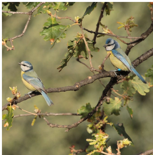
FIGURE 1 Pair of blue tits (female on the left, male on the right) photographed in the Regino valley (around Muro field stations) in Corsica in March 2016.

We studied assortative mating in the blue tit ( Cyanistes caeruleus ), a passerine. Mate choice is likely important in this socially monogamous species, in which birds pair before the breeding season and both sexes provide parental care (see Figure 1). We focused on two ornaments—the blue/UV crown, which is produced by structural coloration, and the yellow breast patch, which results from carotenoid-based coloration. Both features are thought to be targets of social or sexual selection in both males and females (Alonso-Alvarez, Doutrelant, & Sorci, 2004; Limbourg, Mateman, Andersson, & Lessells, 2004; Kingma et al., 2009; Remy, Gregoire, Perret, & Doutrelant, 2010 but see Parker, 2013 for males; Doutrelant, Grégoire, Midamegbe, Lambrechts, & Perret, 2012; Doutrelant et al., 2008; Henderson, Heidinger, Evans, & Arnold, 2013; Midamegbe, Grégoire, Perret, & Doutrelant, 2011; Midamegbe et al., 2013; Parker et al., 2011 for females). If ornaments influence mate choice differently for males and females, multicollinearity can occur among traits. Consequently, we anticipated that the final pattern might be more complex than that normally expected from “simple” assortative mating.