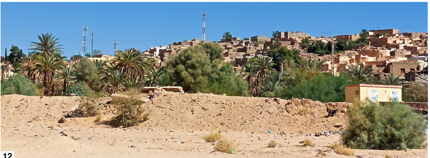
Fig. 11-12. Habitat of Androctonus ajjer sp. n. in Eferi, Djanet Wilaya, Algeria.

Lourenço W. R., 2002a. – Nouvelles considérations sur la systématique et la biogéographie du genre Butheoloides Hirst (Scorpiones, Buthidae) avec description d'un nouveau sous-genre et de deux nouvelles espèces. Revue suisse de Zoologie , 109(4): 725 - 733.