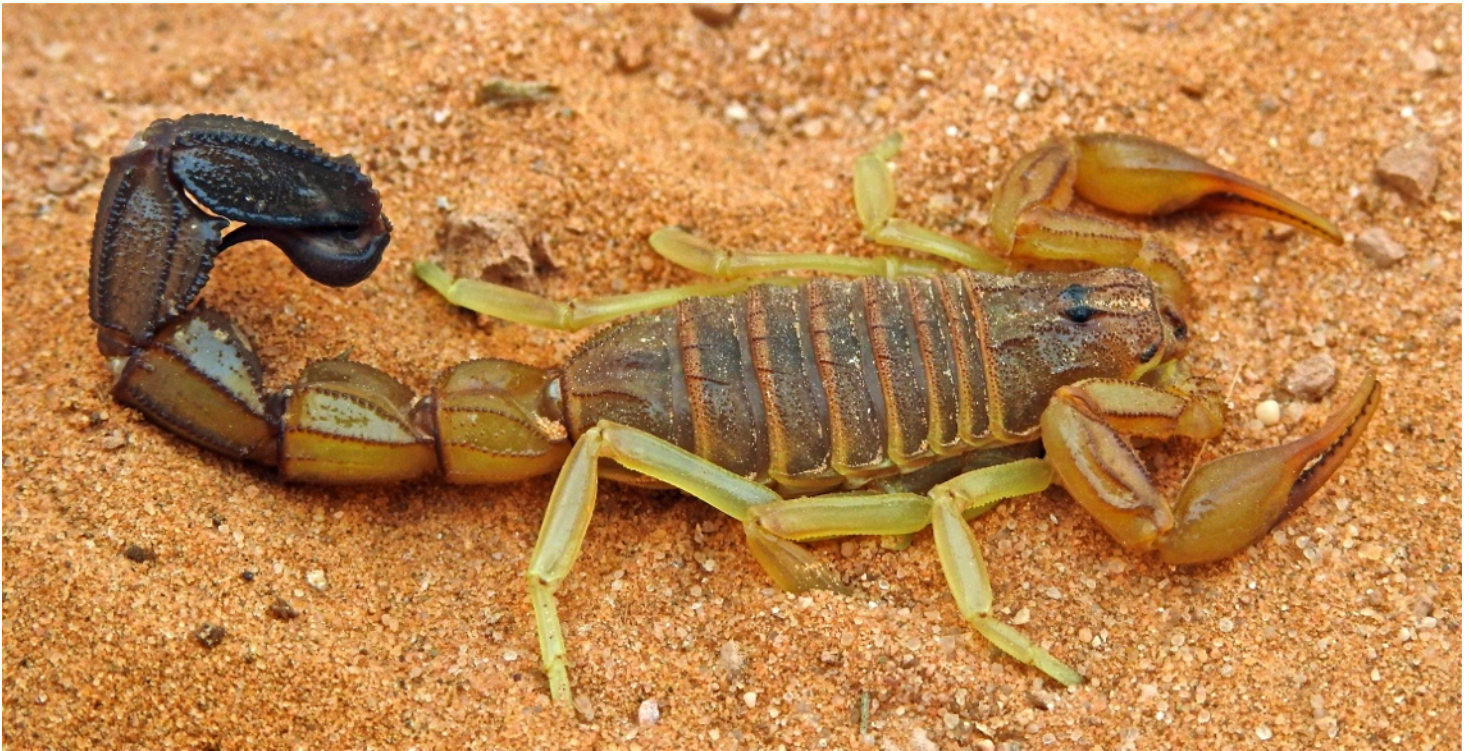
Fig. 10. Androctonus ajjer sp. n., male holotype alive in its natural habitat.

- A. santi , described from the Aïr Massif: