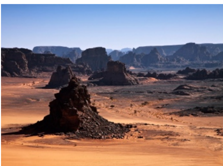
Illustration de la couverture :