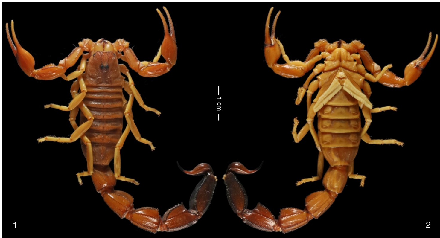
Fig. 1-2. Androctonus ajjer sp. n., ♂ holotype, habitus. 1. Dorsal aspect. 2. Ventral aspect.

pentacarinate; patella with 7 carinae but only dorso-internal and internal are well marked; other carinae are weak to vestigial; chela with vestigial carinae; all faces very weakly granular to smooth; fixed and movable fingers with 12 rows of granules, internal and external accessory granules present, strong; two accessory granules on the distal end of the movable finger next to the terminal denticle; scalloping of the proximal dentate margin of fixed finger in male. Legs: tarsus with numerous thin setae ventrally, arranged in more or less two rows; tibial spur moderate on legs III and IV; basitarsal spurs moderate to strong on legs I to IV; retrolateral basitarsal spur with basal tooth simple (not bifid). Trichobothriotaxy: trichobothrial pattern of Type A, orthobothriotaxic as defined by Vachon (1974). Dorsal trichobothria of femur arranged in \beta (beta) configuration (Vachon, 1975).