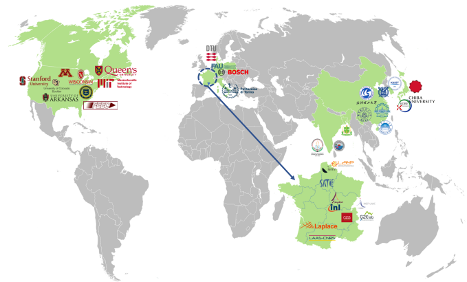
Fig. 1: WorldMap of VHF Actors during the past 10 years (2014-2024)

power conversion during the past 10 years. The countries that are the most involved in VHF power conversion are Denmark, USA, China and Japan. The typical targeted applications by these work is mainly related to wireless power transfer (WPT)[5], LED Drivers[6], Plasma generation[7] and Power tracking system[8].