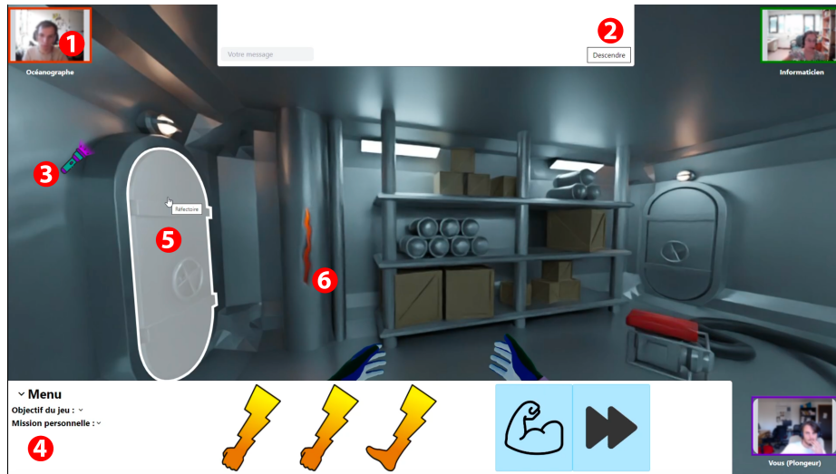
Fig. 2: Game Interface Used in the Study, First-Person perspective. 1) Players' webcam for video communication, 2) Chat window for player communication, 3) Clickable flashlight for environment exploration and item discovery, 4) Game menu with goal, sub-goal, and action options, 5) Highlighted pathway indicating possible movement in the room, 6) Submarine breach requiring repair.

In alignment with the complex dynamics of collaborative learning environments, Collaborative Learning Analytics (CLA) emerges as a vital tool in navigating the wealth of data generated during collaborative learning sessions [54], and can make sense of it for both learners and teachers [55, 76].