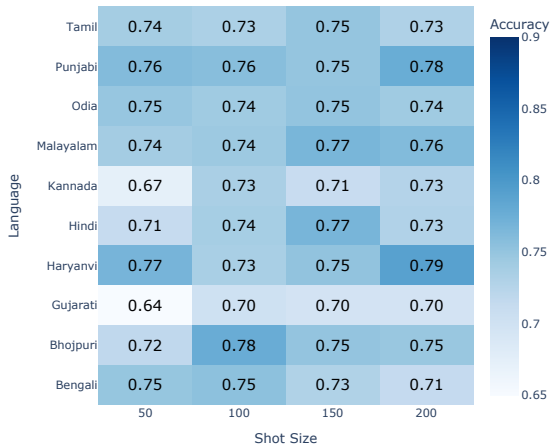
(a) Temporal Mean Wav2Vec