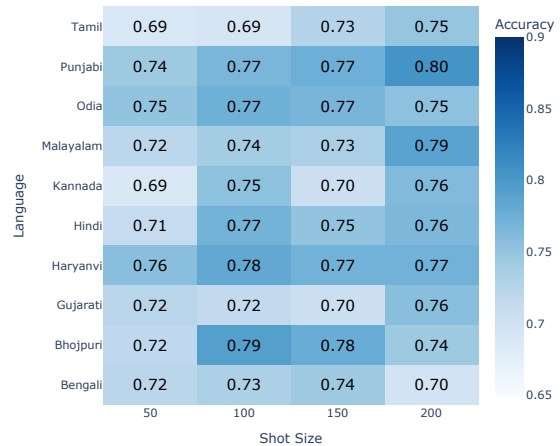
(b) Temporal Mean Whisper