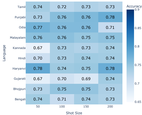
(a) L2-Norm Wav2Vec