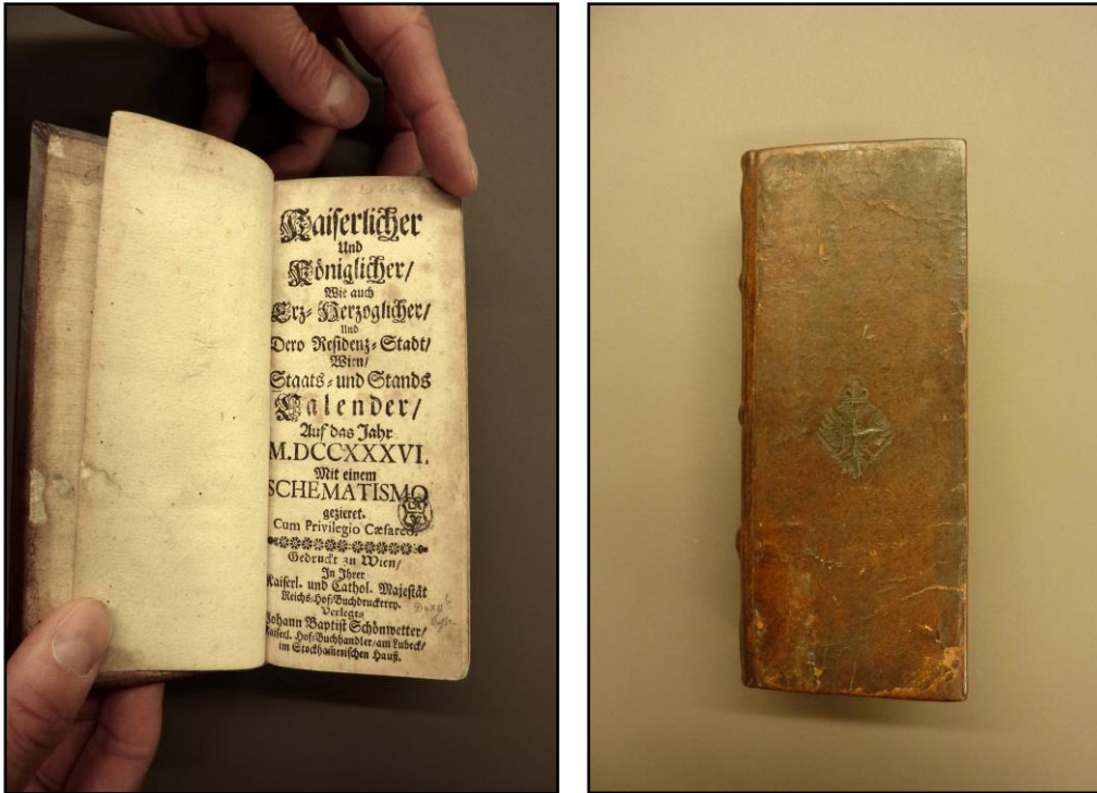
Fig. 5a and b - A transportable book: Kajserlicher Und Königlich-er wie auch Ertz-herzoglicher Und Dero Residentz-Stadt Wiens Staats- und Stands-Calender (Wien, 1736), Strasbourg, Bibliothèque nationale et universitaire, D.184.220.

The functional character of the almanac can be seen in the practicality of its format. Most almanacs were only around 17 x 10 cm, with a thickness increasing from 3 to 5 cm 56 as the administrative staff grew – and was thus easily transportable (fig. 5).