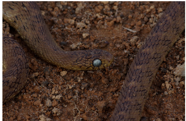
Fig. 16. Adult Dasypeltis fasciata in Bakoumba, Haut-Ogooué Prov., southeastern Gabon.

The adult specimen RMCA 29891 (see Appendix 1) was collected by M. Gauduin in 1969–1970 in “Munana, près de Moanda” [= Mounana near Moanda, in Lébombi-Léyou Dept.]. SM encountered an adult individual in Bakoumba at 20h00 on 12 February 2017 (RBINS 18477; Appendix 1; Fig. 16). Contrary to the Dasypeltis confusa individual above, it was very calm when approached and handled. Its poorly defined black dorsal bands are due to the black color of the interstitial skin between scales, which allows to easily distinguish this species from Dasypeltis confusa which shows black scales forming well-defined saddle-shaped marks on the dorsum, like in the individual shown on Fig. 15. Another individual was found by NR while it was being preyed upon by a Naja melanoleuca on the compounds of the CIRMF in Franceville, Passa Dept., on 25 December 2014 (Fig. 24). First records for the Prov. (not listed from the Prov. by Pauwels and Vande weghe 2008; Carlino and Pauwels 2015; Pauwels et al. 2016a). This species was evaluated as Least Concern by the IUCN; the former species was not yet evaluated.