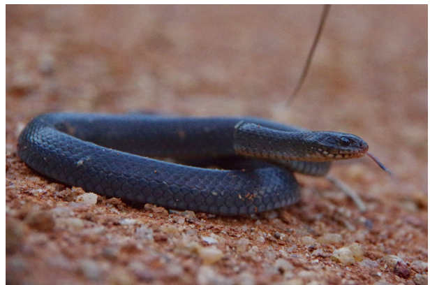
Fig. 28. Adult female Natriciteres olivacea (RBINS 18484) in Lékédi Park, Haut-Ogooué Prov., southeastern Gabon.

An adult female (RBINS 18484, see Appendix 1 and Fig. 28) was encountered by SM at midday on 10 October 2016 in Lékédi Park. It contains four large eggs between the ventrals 93 and 127, each of a length of about 17 mm. It shows a round pupil and a temporal formula of 1+2 on each side. In life the dorsum of this individual was nearly uniformly black, and the mediodorsal band that is characteristic of this species was nearly invisible. New record for the park and new Dept. record (not recorded from the Dept. by Pauwels and Vande weghe 2008; Pauwels et al. 2017a). In Gabon this snake is much less common than its congener Natriciteres fuliginoides (Günther, 1858) which was however not found during our survey; both were evaluated as Least Concern by the IUCN.