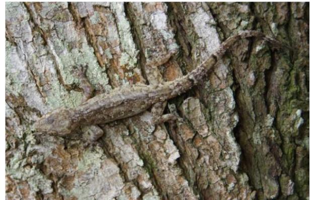
Fig. 8. Adult Hemidactylus mabouia in Léconi Park, Haut-Ogooué Prov., southeastern Gabon.