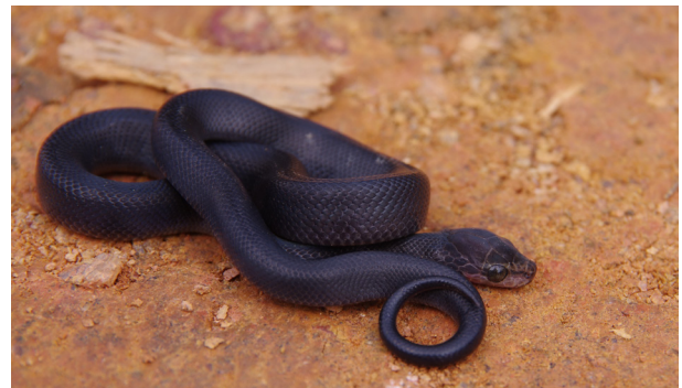
Fig. 26. Young Boaedon perisilvestris in Bakoumba, Haut-Ogooué Prov., southeastern Gabon.

was aggressive and bit when handled. It showed a vertical pupil, one preocular, in contact with the frontal, two postoculars, one loreal, eight supralabials with three (3 rd –5 th ) in contact with the orbit, one anterior temporal, 29 smooth dorsal scale rows at midbody, the vertebral row not widened, a single anal plate, divided subcaudals, two poorly contrasted stripes on each side of the head, and a uniform blackish dorsum without light stripes. An adult female individual showing the same head scalation characteristics, but no stripes on the sides of the head (as is typical for adults, according to Trape and Mediannikov 2016) was found on 26 December 2016 inside a dried well in Lékédi Park. It was resting near the six oblong, white eggs it had just laid. The adult female RBINS 18505 (see Appendix 1) was found by SM in Lékédi Park on 18 November 2016. It contains six large eggs, the largest with a length of 32 mm and a maximum width of 12 mm; its stomach contains the remains of a micromammal. The young individual RBINS 18482 (see Appendix 1) was found in Moanda, Lébombi-Léyou Dept. on 20 November 2016 at 7h00. Its temporal formula is 1+2+3 on each side. Another individual (RBINS 18506; see Appendix 1) was found by SM in Moanda on 5 November 2016; it also shows a temporal formula of 1+2+3 on each side. The adult female RMCA 29885 (see Appendix 1) was collected in “Munana, près de Moanda” [= Mounana near Moanda, in Lébombi-Léyou Dept.] in 1969–1970