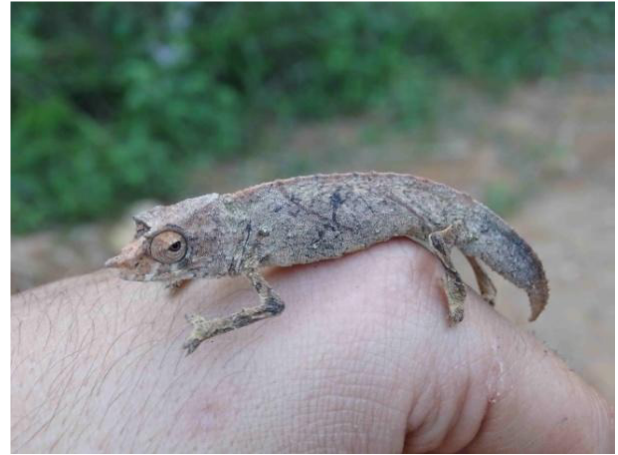
Fig. 7. Adult male Rhampholeon spectrum in Lemanassa, Haut-Ogooué Prov., southeastern Gabon.

listed from this Prov. by Pauwels and Vande weghe 2008; Pauwels et al. 2008). This village is located at about five km from the border with the Republic of Congo. Like the two chameleons above, this species has been evaluated as Least Concern by the IUCN (Mariaux and LeBreton 2010).