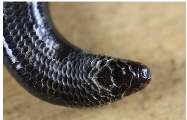
Fig. 10. Young Feylinia currori in Franceville, Haut-Ogooué Prov., southeastern Gabon.

On 10 April 2016 at 17h00 SM found an adult individual (RBINS 18473) active along a road in Lékédi Park. It has a snout-vent length of 156 mm, a tail length of 60 mm, 25 scale rows at midbody, two supranasal scales, one loreal on each side separating the supranasal from the preocular; on each side the ocular scale is in contact with the 3 rd supralabial. Another adult individual (RBINS 18474) was found at 17h00 by SM on 11 October 2016 in a natural ditch in the park; it was then active and quickly moved in the soft soil to hide under a rock. It had a snout-vent length of 164 mm, a tail length of 67 mm, two supranasal scales, 26 scale rows at midbody; its ocular scale is in contact with the 3 rd supralabial. A third individual (RBINS 18498) was found in the park by SM on 7 July 2017 at 17h30; it has a snout-vent length of 128 mm, a tail length of 49 mm, 26 scale rows at midbody, two supranasal scales, and on each side the ocular scale is in contact with the 3 rd supralabial. On 14 November 2017 Jean-Louis Albert (~JLA) found a young individual (total length 120 mm), freshly dead-on-road in Franceville in Passa Dept. (Fig. 10). New record for the park and new Prov. record; Haut-Ogooué Province was the last Gabonese province from which this common species had not yet been recorded (see distribution given by Pauwels and Vandeweghe 2008).