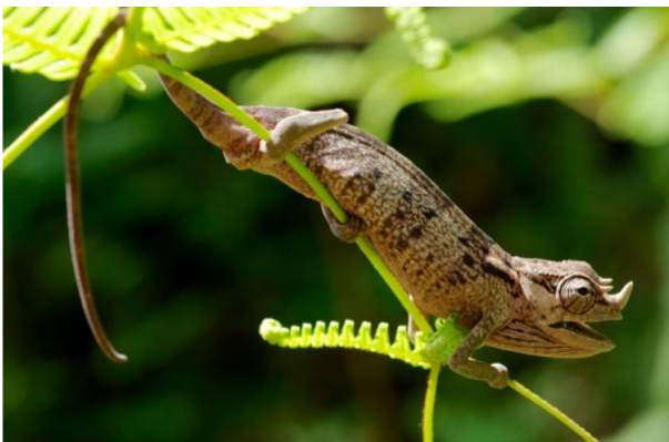
Fig. 6. Young male Trioceros owenii in Lékédi Park, Haut-Ogooué Prov., southeastern Gabon.

On 28 March 2017 at 14h00 SM encountered a young male individual in Lékédi Park, showing three short horns (Fig. 6). On 9, 12, and 15 January SM encountered and photographed three distinct adult males in Bakoumba, all on bare ground between houses in the village. They had distinctly more developed horns than the young individual shown on Fig. 6. Put in presence of each other before being released, two males immediately began a fight. New record for the park and new Dept. record. In Haut-Ogooué Prov., this species had been recorded so far only from Franceville in Passa Dept. (Pauwels et al. 2007) and from Akiéni in Léconi-Lékori Dept. (Pauwels et al. 2016a).