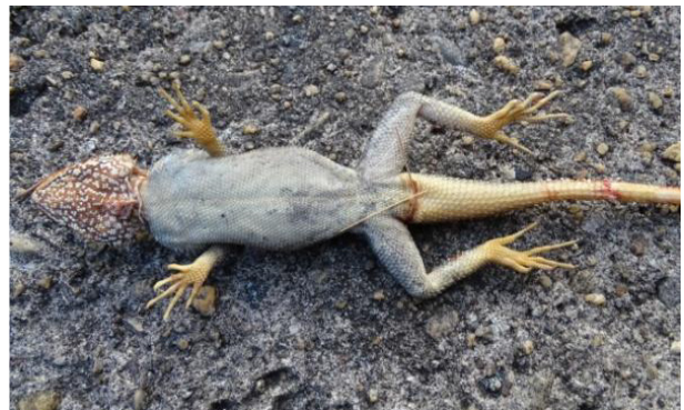
Fig. 5. Ventral view of an adult dead-on-road male Agama lebretoni found on the road between Lékédi Park and Bakoumba, Haut-Ogooué Prov., southeastern Gabon.

This highly anthropophilic species was already recorded by Pauwels et al. (2016b) from Bakoumba, where both Agama species probably co-exist, like in an increasing number of localities in Gabon. The propagation of Agama agama within Gabon is facilitated by human activities and the development of roads (Pauwels et al. 2004).