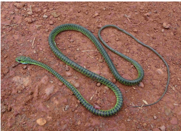
Fig. 20. Dead-on-road Rhamnophis aethiopissa aethiopissa in Bakoumba, Haut-Ogooué Prov., southeastern Gabon.