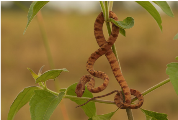
Fig. 22. Adult Toxicodryas pulverulenta in Lékédi Park, Haut-Ogooué Prov., southeastern Gabon.

kitchen of the laboratory in Lékédi Park (Fig. 22) and behaved very aggressively. It showed 21 dorsal scale rows at midbody. New record for the park and for the Dept. (not listed from the Dept. by Pauwels and Vande weghe 2008; Pauwels et al. 2017b,e). OSGP examined two specimens (RMCA 29892–29893) collected by M. Gauduin in 1969–1970 in “Munana, près de Moanda” [= Mounana near Moanda, in Lébombi-Léyou Dept.]. The above male and female specimens had their skulls removed, probably for osteological studies, but their head skin is present and generally in good condition, their tails are complete; part of the ventral skin missing in the second specimen. They show a widened vertebral row. Their temporal formula is 2+2 on each side. Their main diagnostic characters are presented in Appendix 1. X-rays revealed a small bird in the stomach of RMCA 29893. On 22 February 2018 JLA found a dead-on-road adult individual on the road to Amissa Hospital (Hôpital Amissa), Quartier Epila, at six km from the center of Franceville, Passa Dept. It showed (left side) one loreal, one preocular, two postoculars, 8(3-5) supralabials, 2+2 temporals; 2 pairs of sublinguals; an orange tongue; its total length was about 100 cm. New Dept. records. The variation in color, pattern and dorsal scale rows numbers within this species in Gabon requires further studies to assess if one or more species are involved.