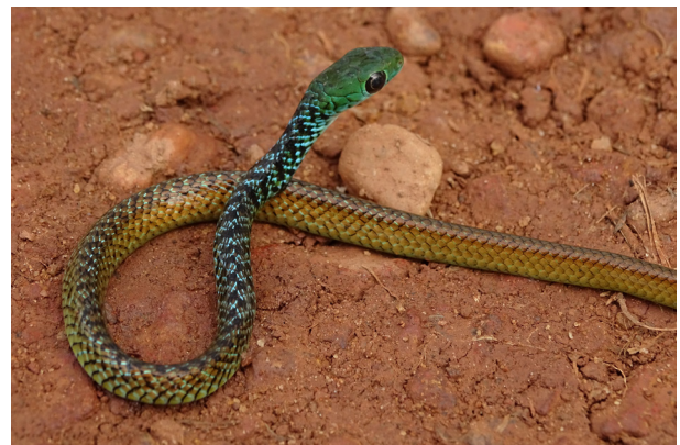
Fig. 19. Juvenile Philothamnus hughesi in Bakoumba, Haut-Ogooué Prov., southeastern Gabon.

On 27 November 2017 at 07h00 SM found a dead-on-road individual (RBINS 18503; see Appendix 1) in Lékédi Park, at 200 m from the guard guerite marking the entrance of the park. Given its poor state, it was probably killed by a car the day before. Its pupil is round; its vertebral row is not widened; its temporal formula is 2+2+2 on each side. First record for the park and for the Dept. This species, which is very common in Gabon, was first mentioned from Haut-Ogooué by Pauwels et al. (2007). Within the Prov., this snake was until now known only from Franceville in Passa Dept.