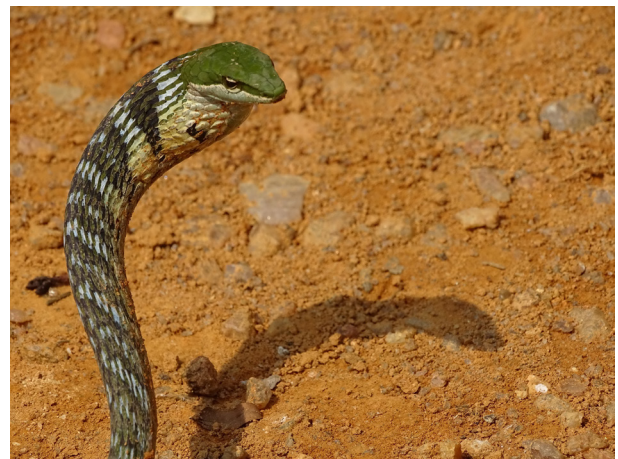
Fig. 21. Adult Thelotornis kirtlandii in defensive posture in Lékédi Park, Haut-Ogooué Prov., southeastern Gabon.

Fig. 21 shows an individual displaying the typical defensive posture, photographed on 27 June 2016 at 10h00 by SM in Lékédi Park. New record for the Dept. and for the park (not listed from the Dept. by Pauwels and Vande weghe 2008). The species was first recorded from Haut-Ogooué Prov. by Pauwels et al. (2007). This snake, which avoids primary forests and lives mostly in clearings and cultivated areas, is one of the most commonly encountered species in Gabon.