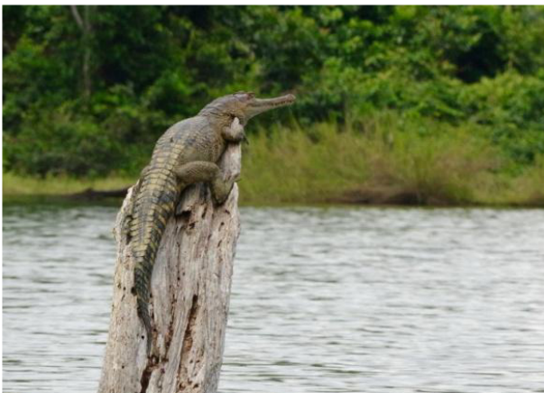
Fig. 3. Adult Mecistops cataphractus on a dead tree in Lékédi Park, Haut-Ogooué Prov., southeastern Gabon.

Pearson et al. (2007) presented the picture of an individual in Plateaux Batéké NP, clearly showing the whole body and the long snout. Fig. 3 shows an adult individual photographed on 17 October 2016 in Lékédi Lake (Lac Lékédi) in Lékédi Park. This individual is regularly observed on this dead tree when one navigates on the lake, and it jumps forward when it is too closely approached. It climbs on this tree on sunny days as well as on cloudy days, and often keeps its mouth widely open. No census of the Mecistops population of the 120 ha Lékédi Lake was ever done, but a 45 minutes canoe trip by night on the lake in June 2017 by SM revealed ten distinct individuals, mostly juveniles and subadults. A second canoe tour on the lake on 21 July 2017 between 18h30 and 21h30 revealed 25 distinct individuals, indicating that further search efforts might demonstrate the existence of a viable population. Our observations represent a new Dept. record and a new record for the park (not listed from this Dept. by Pauwels and Vande weghe 2008; Pauwels et al. 2016b, 2017e).