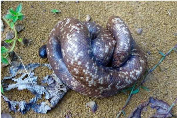
Fig. 13. Adult Calabaria reinhardtii in Lékédi Park, Haut-Ogooué Prov., southeastern Gabon.

2016 by SM in Lékédi Park (Fig. 13). When encountered, it was entering a crack in a brick wall. When handled, it never tried to bite, and displayed several times the species' typical defensive behaviour, i.e., forming a ball with its body and raising its rounded tail. Another individual was photographed by SM in the park on 13 November 2017; while being photographed, it adopted the same defensive behaviour. New record for the Dept. and for the park (not listed from the Dept. by Pauwels and Vande weghe 2008). This common species was first recorded from Haut-Ogooué Prov. by Pauwels et al. (2007).