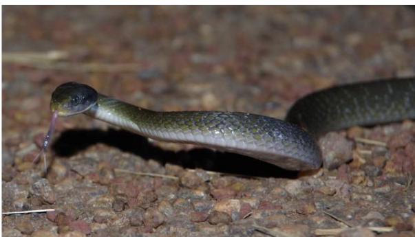
Fig. 14. Adult Crotaphopeltis hotamboeia in Bakoumba, Haut-Ogooué Prov., southeastern Gabon.

An adult individual was photographed by SM on 5 January 2017 in Bakoumba (Fig. 14). New locality record. Two other individuals (RBINS 18475–76; see Appendix 1) were found by SM in Lékédi Park on 17 March 2017, and another was photographed by SM in the park on 11 December 2017. All were aggressive, attempting to bite when approached. The species was already recorded by Pauwels et al. (2016b) from Lékédi Park where it can be regarded as common. It was mentioned for the first time from Haut-Ogooué Prov. by Pauwels and Sallé (2009).