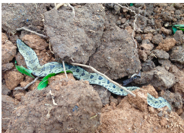
Fig. 32. Adult Causus maculatus in Moanda, Haut-Ogooué Prov., southeastern Gabon.