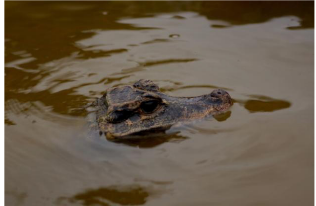
Fig. 4. Adult Osteolaemus tetraspis in Lékédi Park, Haut-Ogooué Prov., southeastern Gabon.

On 13 November 2017 at 17h00 SM photographed an adult individual in a ditch in Lékédi Park (Fig. 4). New record for the Dept. and for the park (not listed from this Dept. by Pauwels and Vande weghe 2008; Pauwels 2016). The Dwarf crocodile is often sold as food, but it still ubiquitous in Gabon, even in degraded areas; it has been recorded from nearly all protected areas in the country (Pauwels 2016).