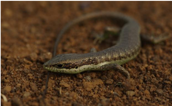
Fig. 11. Young Trachylepis polytropis polytropis in Lékédi Park, Haut-Ogooué Prov., southeastern Gabon.

The individual RBINS 18501 was encountered by SM on 4 January 2017 in Lékédi Park. It shows a transparent disk in each lower eyelid, 4/4 supraoculars, 5/5 supraciliaries; 6/6 supralabials; supranasals separated by a narrow gap, prefrontals separated by a narrow gap; 54 scales on a line between the nuchals and a point above the base of the tail; a snout-vent length of 71 mm, a tail length of 125 mm; and 30 scale rows at midbody, each dorsal scale with 5, sometimes 6 or 7, keels. RBINS 18502 was found by SM in the park on 19 August 2017. It shows a transparent disk in each lower eyelid, 4/4 supraoculars, 5/5 supraciliaries; 7/7 supralabials; supranasals separated, prefrontals in contact; 54 scales on a line between the nuchals and a point above the base of the tail; a snout-vent length of 64 mm, a tail length of 132 mm; and 30 scale rows at midbody; each dorsal scale with 5 keels. This species is locally common in open areas in the park, and was regularly observed by SM in 2016 and 2017. It had already been recorded and documented from the park by Ineich and Le Garff (2015).