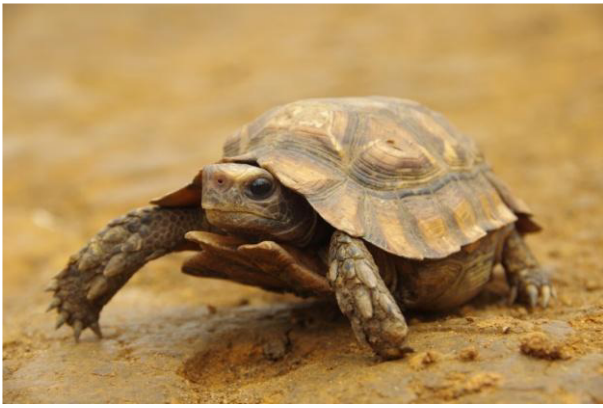
Fig. 2. Young Kinixys erosa in Lékédi Park, Haut-Ogooué Prov., southeastern Gabon.