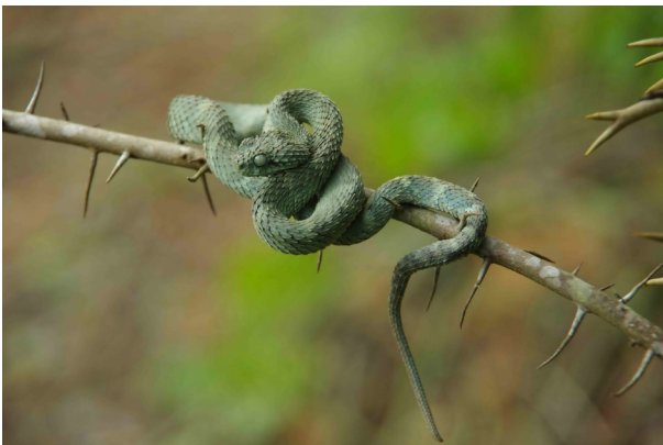
Fig. 30. Atheris squamigera in Bakoumba, Haut-Ogooué Prov., southeastern Gabon.

Pearson et al. (2007) presented a picture of a light green Atheris with well-spaced yellowish transversal rings from Plateaux Batéké NP, that they identified as a “bush viper (possibly Atheris squamigera or A. chlorenchis .” On 17 September 2016 SM photographed an individual in Bakoumba (Fig. 30). New Dept. record (this arboreal viper species was not recorded from the Dept. by Pauwels and Vande weghe 2008; Pauwels et al. 2016b, 2017d,e).