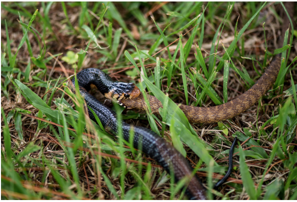
Fig. 24. Young Naja melanoleuca swallowing an adult Dasyplectis fasciata in Franceville, Haut-Ogooué Prov., southeastern Gabon.