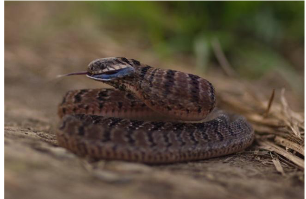
Fig. 15. Adult Dasypeltis confusa in Lékédi Park, Haut-Ogooué Prov., southeastern Gabon.

ing itself and adopted a threatening posture all the time it was approached. New Dept. record and new record for the park. This recently described egg-eating species was first reported from Gabon by Pauwels and Sallé (2009).