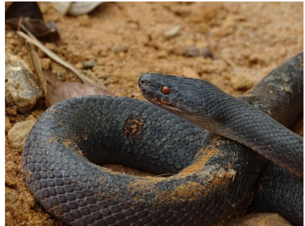
Fig. 25. Adult Boaedon olivaceus in Bakoumba, Haut-Ogooué Prov., southeastern Gabon.

A young individual was encountered by SM at night near buildings in Bakoumba on 23 March 2016 (Fig. 26). It