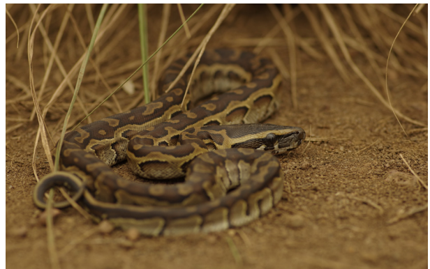
Fig. 29. Juvenile Python sebae in Lékédi Park, Haut-Ogooué Prov., southeastern Gabon.

The record of the species from Plateaux Batéké NP by Christy et al. (2008) was based on a pers. comm. to OSGP by Gaël Vande weghe who observed an individual along Mpassa River in the NP in April 2007, and on a picture of a large adult individual shown in Pearson et al. (2007). On 15 January 2018 at 13h00 SM discovered a juvenile in Lékédi Park (Fig. 29). We examined pho-