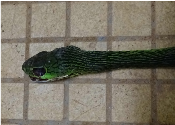
Fig. 18. Dead-on-road adult Hapsidophrys lineatus found near Bakoumba, Haut-Ogooué Prov., southeastern Gabon.

A dead-on-road adult individual was found by SM on 5 June 2016 between Lékédi Park and Bakoumba (Fig. 18). It shows a round pupil, one loreal, one preocular, no subocular, three postoculars, two supralabials in contact with the orbit, two anterior temporals and two posterior temporals, strongly keeled dorsals with the vertebral row not widened, and keeled ventrals. New Dept. record (not listed from the Dept. by Pauwels and Vande weghe 2008). Hapsidophrys lineatus being rarely encountered in Gabon and difficult to approach due to its shyness and fastness, Pauwels and Vande weghe (2008:165) also had to illustrate it with the photograph of a dead-on-road individual. This strongly contrasts with its congener H. smaragdinus , which is one of the most commonly encountered snakes in the country and easier to approach.