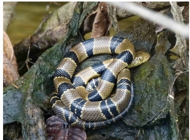
Fig. 23. Naja annulata annulata in Lékédi Lake, Haut-Ogooué Prov., southeastern Gabon.

An individual of this freshwater cobra was photographed by SM on the shore of Lékédi Lake in Lékédi Park (Fig. 23). It quickly escaped to the water after having been photographed. New record for the park and for the Dept. (this cobra species was not listed from the Dept. by Pauwels and Vande weghe 2008; Pauwels et al. 2017a).