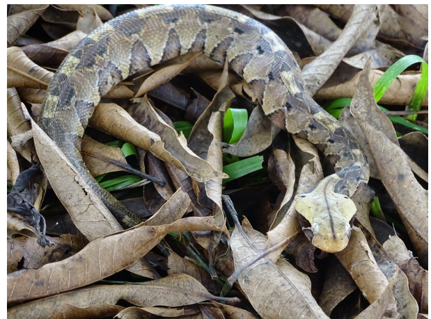
Fig. 31. Young Bitis gabonica in Lékédi Park, Haut-Ogooué Prov., southeastern Gabon.