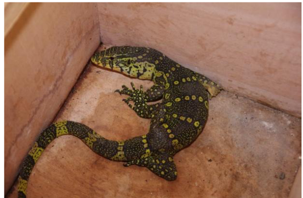
Fig. 12. Adult Varanus ornatus in Bakoumba, Haut-Ogooué Prov., southeastern Gabon.

Pearson et al. (2007) presented a picture of a monitor taken in Plateaux Batéké NP that they identified as “ Varanus sp. (probably V. niloticus ).” The photo shows a juvenile individual with five transversal rows of ocellae on the back between the fore and hindlimbs, as is typical for V. ornatus . A photograph of another individual from Plateaux Batéké NP was presented by Pauwels and Vande weghe (2008:127). On 25 March 2016 SM photographed an adult individual in Bakoumba (Fig. 12). On 22 October 2016 at midday SM photographed a subadult individual (total length about 70 cm) inside a dead tree standing above the surface of Lékédi Lake in Lékédi Park. New Dept. record and new record for the park (not listed from the Dept. by Pauwels et al. 2007, 2017d,e). Although heavily hunted, this monitor is still abundant in all parts of the country and in all kinds of environments, from pristine forests and savannas to urban areas; it was recorded from nearly all protected areas of Gabon (Pauwels, 2016). Dowell et al. (2015) did not fully resolve the systematics within the Varanus niloticus complex and called for “urgent taxonomic revisions in this group;” until more conclusive results are obtained, we prefer to maintain here the use of the name Varanus ornatus for the Varanus populations found in Gabon.