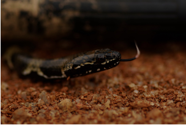
Fig. 17. Young Grayia ornata in Lékédi Park, Haut-Ogooué Prov., southeastern Gabon.

A young individual was photographed by SM in Lékédi Park at midday on 28 December 2017 (Fig. 17). New record for the park and for the Prov. Haut-Ogooué Prov. is the last province of Gabon from which this common freshwater species had not yet been recorded (Pauwels and Vande weghe 2008).