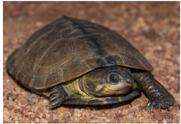
Fig. 1. Subadult Pelusios gabonensis in Franceville, Haut-Ogooué Prov., southeastern Gabon.

poorly marked median keel on the carapace, a brown head without vermiculations but with a black dorsal triangle. This constitutes the first record for the park. Within the same Dept., the species had already been recorded from Bakoumba by Maran and Pauwels (2005). On 22 January 2017 at 17h25 Nil Rahola (~ NR) photographed a subadult individual in the northwestern suburbs (1°36'58.3"S, 13°34'48.7"E) of Franceville in Passa Dept. (Fig. 1). This represents a new locality record (see the compilation on the distribution of this species in Gabon by Maran and Pauwels 2005). Widely distributed in Gabon, this terrapin is heavily hunted for food, and is so far known from only three protected areas in the country (Pauwels 2016).