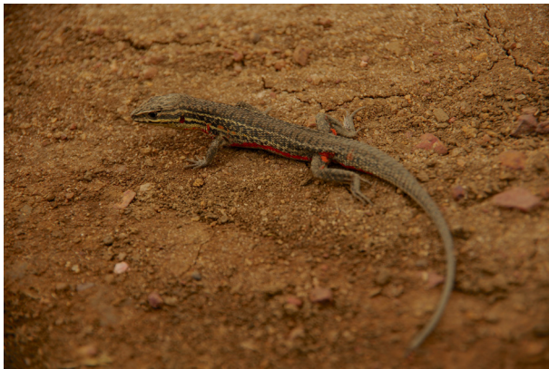
Fig. 9. Adult Ichnotropis bivittata in Bakoumba, Haut-Ogooué Prov., southeastern Gabon.

A juvenile (RBINS 18472) was found dead-on-road on 2 November 2016 by SM near the camp of the Projet Protection des Gorilles (PPG) of the Aspinall Foundation in the northern part of the Plateaux Batéké NP. It has a snout-vent length of 47 mm and a tail length of 105 mm. Its dorsal scales are keeled, its ventral scales smooth; its caudal scales are all keeled, except the ventral ones at the base of the tail. New locality record. This lizard is common in the savannas and coastal grasslands of Gabon and has already been recorded in nine national protected areas (Christy et al. 2008; Pauwels and Vandeweghe 2008; Vandeweghe 2008: 156–157).