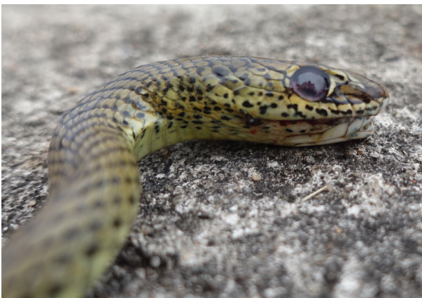
Fig. 27. Dead-on-road adult Psammophis cf. phillipsii in Franceville, Haut-Ogooué Prov., southeastern Gabon.

On 5 July 2017 JLA found a dead-on-road adult individual on the road to Amissa Hospital, at six km from the center of Franceville, Passa Dept. Its total length was about 105 cm (including the incomplete tail). A second individual was found dead-on-road in the same locality on 13 July 2017 (Fig. 27); its total length was about 110 cm. Both showed a round pupil, two internasals, two prefrontals, eight supralabials of which the 4 th and 5 th in contact with orbit, one large preocular, two postoculars, an elongate loreal, two anterior temporals, 17 smooth and oblique dorsal scale rows at midbody (vertebral row not widened), divided anal and subcaudals, and an olive brown dorsum with a black spot in the posterior part of each ventral; the dorsal surface of the head is olive brown with irregular black spots. On 11 August 2017 SM found a dead-on-road individual in Moanda, Lébombi-Léyou Dept. It showed the same head scalation features as the two specimens above, and the same coloration. New Prov. record (not recorded from the Prov. by Pauwels and Vande weghe 2008; Pauwels et al. 2016b, 2017a).