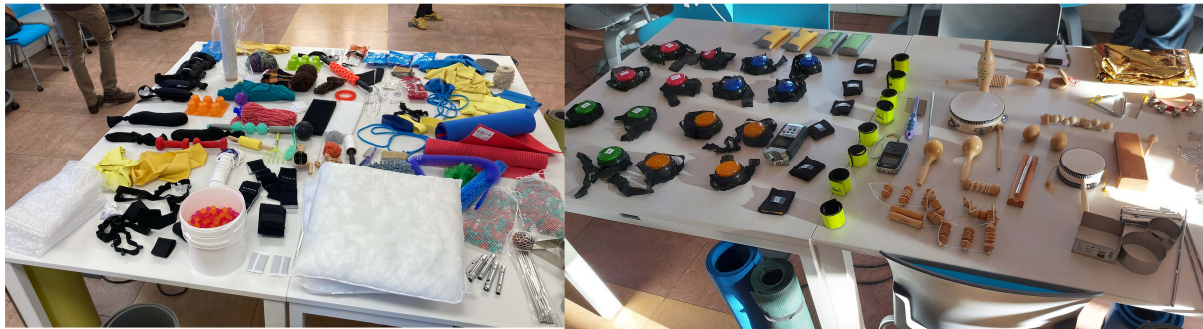
Fig. 3. Probes used in the Workshop 3 (Left), and probes in the Workshop 4 (Right).

In Workshop 3, a Somatic Dress-up activity aimed to recreate the body sensations of the personas by exploring various sensory ideation probes [105]; activities involved "designing" and "wearing" the body, using available objects and prompts with different material qualities, so barriers could be physically manifested and experienced. Participants, divided into two groups, were assigned a scenario to work with (Leticia or Manuel in their associated context) (see scenarios in Supplementary Material #2). The process began with each participant selecting a