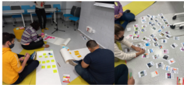
Barriers cards and participants identifying which one is related to them.