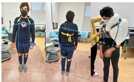
Fig. 4. Enactment of the persona (P-Leticia: left and center; P-Manuel, right) through "somatic dress-up." Participants grouped together to "dress-up" one of their peers as the chosen persona, for which they used their individually explorations and "somatic dress-up probe design."

In the final, fifth workshop, held during a science dissemination event, open to the general public at University Carlos III de Madrid, we experienced and refined sensory patterns for activation that originated from Workshops 3 and 4. 13 attendees participated, 11 categorized as physically active and 2 as physically inactive based on their responses to the IPAQ questionnaire. The workshop aimed to explore, iterate and concretize the sensory patterns for activation that emerged from Workshops 3 and 4, and better understand their potential. We divided participants into 4 groups, each focused on exploring a subset of either auditory or haptic patterns, generated using sensory probes from prior workshops alongwith a set of other sensory probes for introducing variations in these patterns. One of the authors facilitated explorations in each group, introducing participants to sensory signals, explaining what worked for physically inactive participants in previous workshops, giving prompts