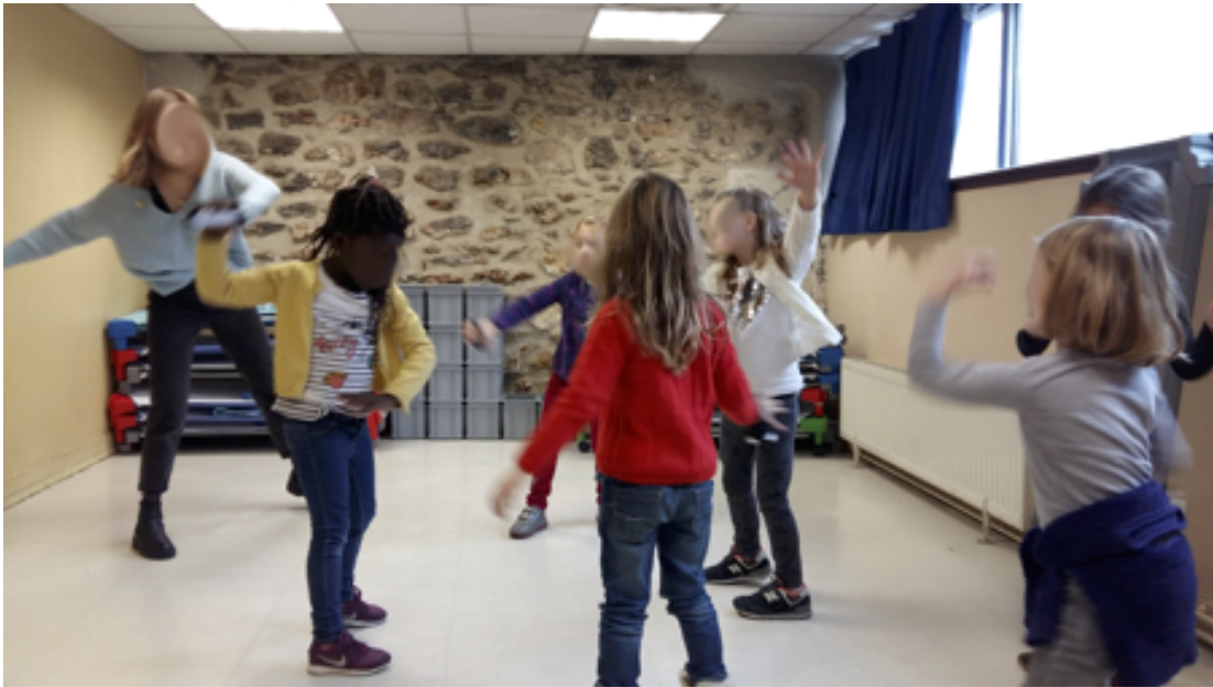
Fig. 1. Use of CoMo•education in a classroom.

The aim of the CoMo•education is to develop a movement-based application that supports storytelling practices in preschool. The central idea is that certain parts of the story are “performed” collectively by the teacher and the children, by miming certain gestures and movements (Fig. 1). Using a gesture recognition system, the children’s movements trigger specific soundscapes, designed to accompany and enliven specific parts of the story (see section 4 for technical details). The sound narrative is aimed at mobilising the whole-body, promoting kinaesthetic and collective interactions. In this section we first describe the design process and requirements we progressively established throughout the project. The CoMo•education was conducted through an iteration process involving different stakeholders of the preschool environments, with an ecological approach, by grounding experiments and evaluation in kindergarten. Importantly, our approach was inspired by the work of Eleanor J. Gibson and Anne D. Pick’s work on “Perceptual Learning and Development”. This ecological approach takes into account the richness of the child’s environment [17] and their diversity.