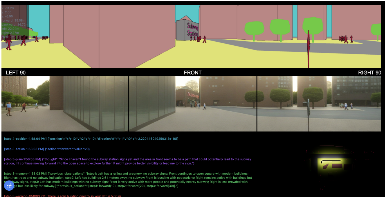
Figure 2: TravelAgent simulation interface showing a street scene with agent navigation logs and decision-making process. This platform visualizes the agent’s perception and behavioral decisions in different urban scenarios.

Objectives: TravelAgent aims to evaluate how individuals might respond to different design scenarios, such as varied urban design elements of a street section, the spatial arrangement of a public plaza affecting wayfinding, or visitor navigation through a museum exhibition. By analyzing the behavior of generative agents in these simulations, designers can gain insights into the potential challenges, risks, and opportunities of various design choices prior to real-world implementation. This tool enhances our understanding of human-environment interaction and assists urban planners and designers in creating more intuitive, user-friendly spaces.