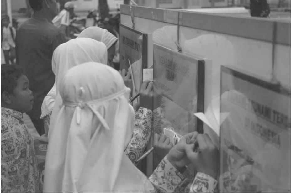
Plate 1. Posters exhibition at Parangkusumo primary school during the sensitization campaign

stage – usually held just after the educational documents have been disseminated – cannot be maintained for financial reasons, and thus people are not guided to adapt the received educational information to their local living context. To maintain the discussion stage, it would require the permanent attendance of a person with perfect knowledge of each kilometer of the Indonesian coastal area. We hope the current documentation made available will eventually include information on a high number of specific places, so that everyone coming to Parangtritis can find information on the residential areas, notably through precise risk mapping. The information already in place also should evolve. A quiz game on tsunamis delivered to visitors allows permanently assessing awareness, knowledge and perception of tsunami risk by the population and if necessary, the educational materials can then be modified.