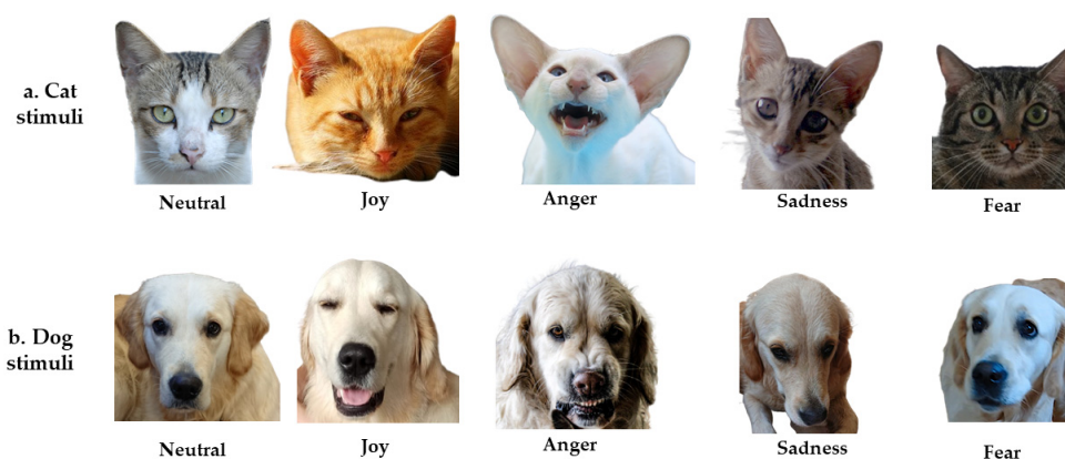
Figure 1. (a) Example of cat stimuli (sources: Neutral—Thinkstock/Getty Images (modified) and Borgi et al. (2014); Anger—Pxhere (modified, background removed); Joy, Fear, and Sadness—Kaggle (modified, background removed). (b) Example of dog stimuli, specifically featuring the Golden Retriever breed (Anger—Inès Sauvage; other emotions—personal sources). Illustration of human stimuli was not permitted, as they were sourced from the FACES data bank.

as the service dog) depicting five different emotions (i.e., sadness, joy, fear, neutral, anger) and five pictures of different dogs of different breeds, each depicting a different emotion. The photographs of cats included 10 pictures of different breeds, depicting five different emotions (Figure 1a,b as example). Finally, the photographs of humans represented five women and five men, also depicting five different emotions. The photographs of dogs and cats were sourced from Bloom and Friedman (2013); Borgi et al. (2014), Inès Sauvage, Pxhere, Kaggle, and authors' personal sources. The photographs of humans were extracted from the FACES databases. Thus, our complete test set included 30 photographs of three species, depicting five different facial expressions (i.e., sadness, joy, fear, neutral, anger) with two exemplars of each emotion. Disgust and surprise (two so-called "universal emotions"; Ekman, 1994) were not included, as dogs' and cats' facial expressions of disgust are difficult to provoke, whereas surprise is similar to and easily confused with fear. Moreover, according to Taylor et al. (2015) individuals with developmental impairments, such as ASD and specific language impairments, have more difficulties recognizing surprise and disgust.