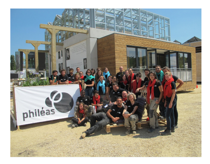
Figure 2. Solar Decathlon Europe 2014. Team Atlantic Challenge with students of the School of architecture and two Schools of engineering.

Thus, we can question the way in which experiences "outside the walls" - whether they are part of an educational framework or "all against" - shape the trajectories of architecture students and endow them with a specific spatial capital. The figure of the "pass-through" would make it possible to explore the type of borders (disciplinary, scalar, social but also more symbolic, etc.) that the students collide with, cross or from which they free themselves during these experiences. It is a question of understanding how the students foster the acquisition of knowledge, know-how and interpersonal skills, in particular between peers. The concept of "space defector" (like the "class defector") might help as a possible characterization of these future architects.