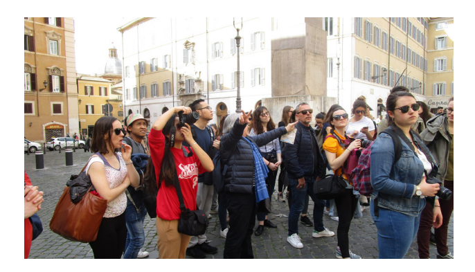
Figure 1. Study trip to Rome of second year students.

"Outside the walls" offers specific space-times of socialization which tend to unframe the relationship between students and teachers, but also between peers. Study trips in full promotion (to Paris in the first year, to Rome in the second year) or partial (to a European capital in the third year), field surveys during tutorials in sociology or on-site immersion during project workshops, but also more individual experiences such as internships, are all opportunities to socialize with architecture outside of school.