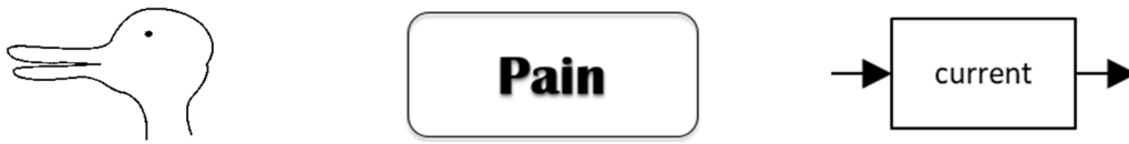
Figure 2. A drawing, a sign, and a diagram with multiple competing interpretations

meaning, the recognition of meaning precedes and leads to hypothesizing the language of an inscription, a case of abduction (Eco, 1986).