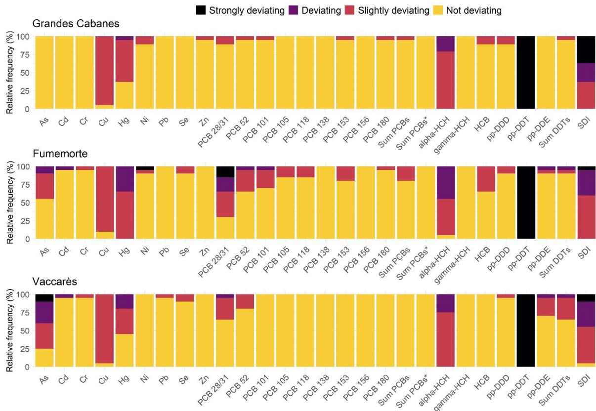
Fig. 2: Eel Quality Classes (EQC) distribution of silver eels (males and females grouped together) from Grandes Cabanes, Fumemorte and Vaccarès sites. Twenty-eight parameters were considered in \text{ng}\cdot\text{g}^{-1} ww, with Sum PCBs corresponding to the sum of the 7 PCBs (PCB 28/31, 52, 101, 118, 138, 153 and 180) in \text{ng}\cdot\text{g}^{-1} ww (except Sum PCBs* was the sum of the 7 PCBs in \text{ng}\cdot\text{g}^{-1} lipid weight; Cu, Zn were in \mu\text{g}\cdot\text{g}^{-1} ww and SDI without unit).

PCB 101, \alpha -HCH, pp-DDT, pp-DDE and Sum DDTs) and the SDI (Fig. 2). The proportions of the different EQC classes differed between sites for 17 of the 27 contaminants analysed and for the SDI (chi-2 test, p \leq 0.01 ). Eels from the Grandes Cabanes site were less contaminated with POPs and TEs than those from the Vaccarès site, which were less contaminated than those from the Fumemorte site. Silver eels from the Grandes Cabanes site had a higher SDI (Fig. 2).