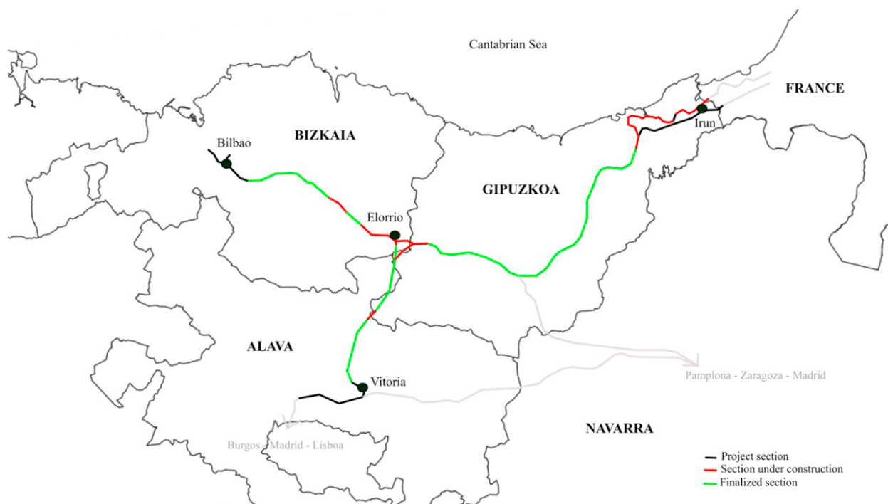
Fig. 3. Building status of Y Basque HRL at the end of 2022.

Furthermore, on 12 December 2002, the Basque government launched a call for tenders to the drafting of projects for six sections of the Basque Y. The project had two specifications (Basque and Spanish governments). The construction of the Basque Y only started in 2006 and should be finished in 2027, i.e. 5 to 7 years earlier than the GPSO which has not yet started. According to this representation (see figure 3), we can see that the construction of the entire network is practically complete. However, it is important to specify that the connectivity of the new high-speed line from Vitoria to Burgos, Bilbao to Santander and San Sebastián to the French border is still in the planning stage. Without the completion of the high-speed line, interoperability is therefore impossible. Aware of this lack, in May 2021 the Spanish government authorised the tender for the work between Astigarraga and Irún, thus ensuring the link with the French border via the Madrid - Hendaye line 13 .