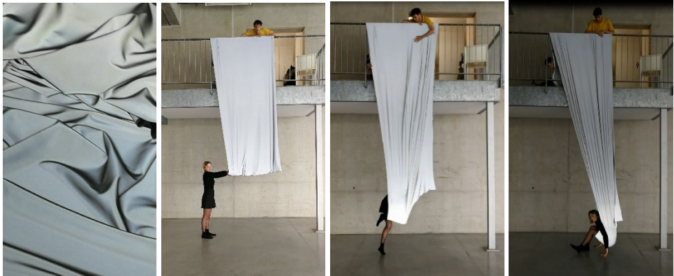
Fig. 1. Tests and manipulation by students with the retro-reflective fabric: silky aspect, deformation and resistance, lighting reflections.

immersive and sensory ride. The journey is strange, difficult but pleasant, led by a weakened gravity and a flexible, expandable medium. The material that makes the walls of this universe represents an incredible, almost improbable, paradox. Even though it is made of glass, it is soft to the touch in a soporific way, and has a mesmerizing flexibility. The body ultimately sits or lies down to enjoy the visual show. Similar to a psychedelic daydreaming, the glass material decomposes the light. Reflected and turned into a multi-coloured spectrum, it moves and accompanies its disturbed universe.” The efforts made by the body to enter this space are proportional to the efforts the fabric makes to welcome its guest.