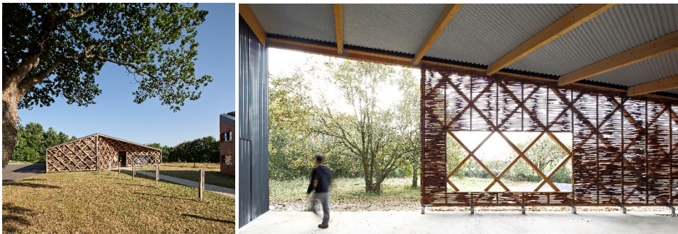
Fig. 3. Lycée Rieffel, Mabire&Reich Agency, Saint Herblain, France.