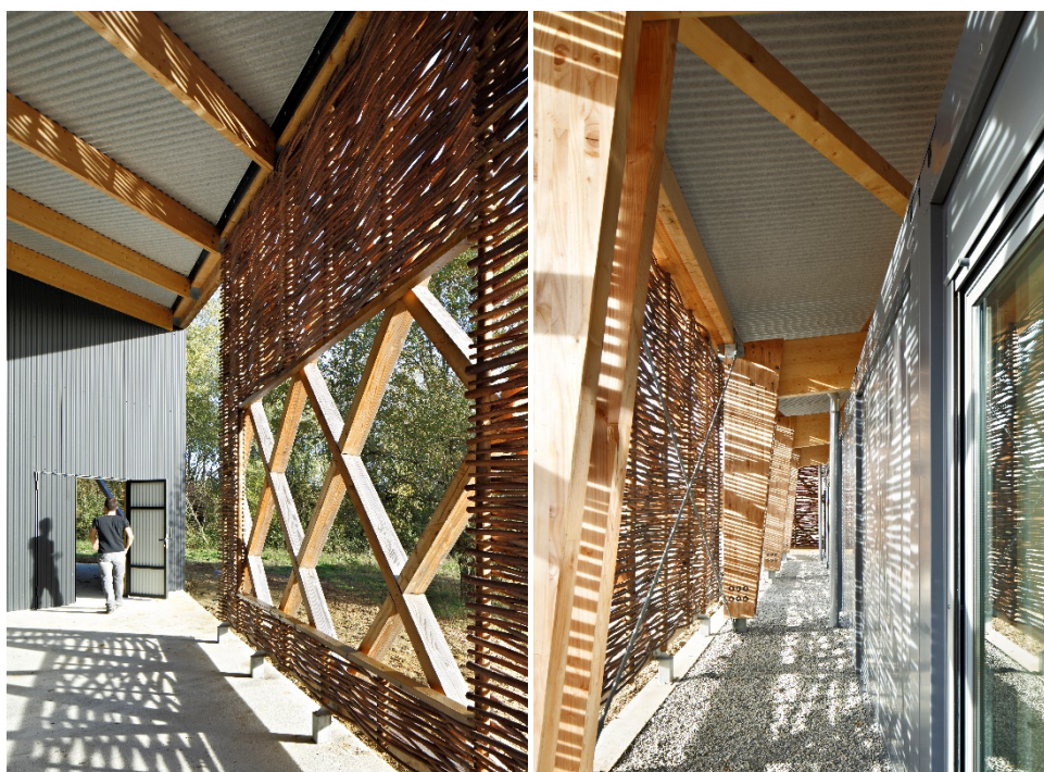
Fig. 5. Ambiances in the building Lycée Rieffel, Mabire&Reich Agency, Saint Herblain, France.

However, as architecture is defined as the passage from a conceptual idea to its materialisation, working via the material seems to ensure a deeper reflection on the sensory qualities of space, to reach “a harmony between the project and the materiality, until we find a perfect agreement between the programme, the form and the material.” [11] (p.85), which goes through “creativity, which invites the comparison of materials, to take them out of their context or to think them under new forms and structures” [11] (p.85).