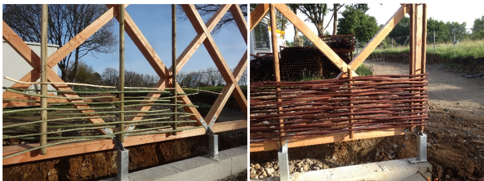
Fig. 4. Tests for weaved wicker, Lycée Rieffel, Mabire&Reich Agency, Saint Herblain, France.