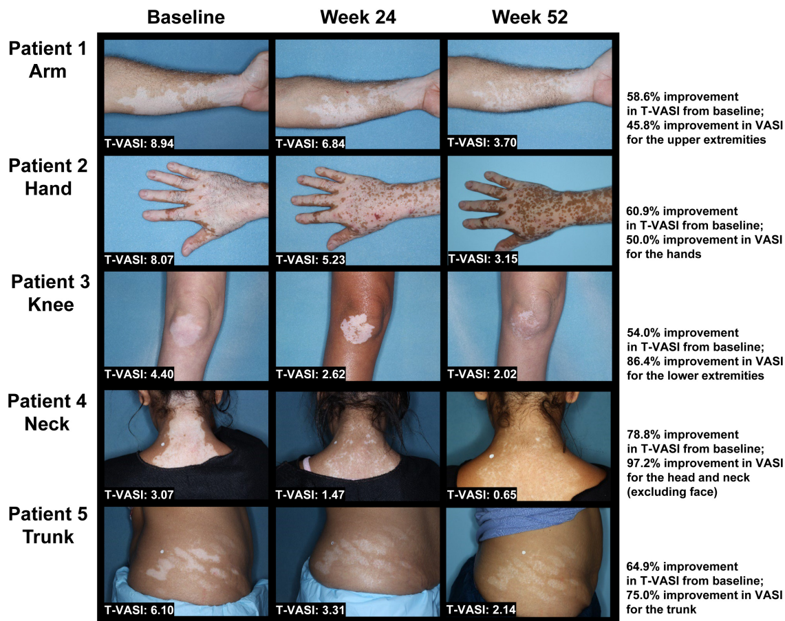
FIGURE 2 Clinical images showing repigmentation of body regions with 1.5% ruxolitinib cream twice daily. T-VASI, total Vitiligo Area Scoring Index (scores include the face); VASI, Vitiligo Area Scoring Index.