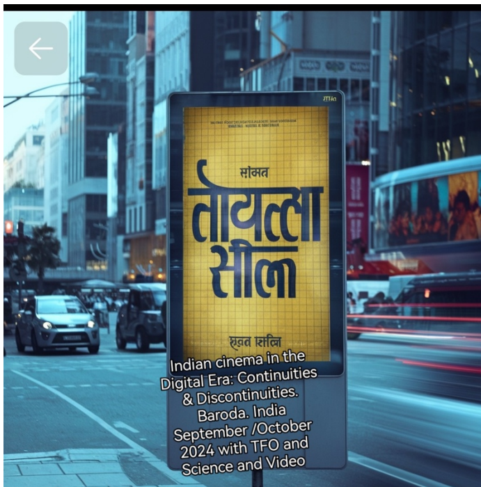
5-AI image created by FLH with Invideo, 2024.

When affordable smartphones for the middle class and cellular data became ubiquitous in the 2010s in India, internet access became a big bang. A big bang in communications and freedom of speech. If I repeat this sentence, it is because internet explosion was a major event with multiples societal and economic consequences.