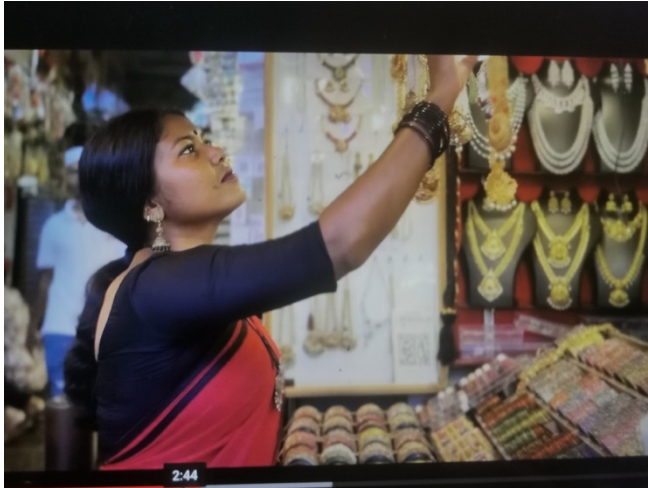
4-Baala (2024)-2:44 (Time code)-Directed by Hafeefa Jebi

The message of the film is innovative. Young ladies' expression's through digital cinema are aspiring to change gender perceptions in the Indian society. The reduction of costs in filmmaking with new technologies are obviously giving them more opportunities to express their own views.