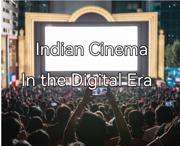
3-AI- Invideo creation with FLH.2024

It is possible, more than ever before, to create a film with a very low budget. This possibility did not exist in the previous years. It will erase many jobs in the cinema industry offering a lot of autonomy to young artists without budget. Digital audio editing and post-production are offering to Indian women filmmakers' incredible opportunities that they are already experiencing. The last TFO festival (June 2024) is demonstrating how clear young women are voicing their aspirations. The winners of the festival demonstrated incredible desire of change in the society. I will mention the 5 winners, but we must admit that the films proposed were globally very imaginative and offering signs of discontinuities in the history of Indian cinema. These students' short films could be considered a landmark in the Indian visual revolution in filmmaking in India.