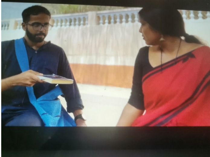
9- Baala (2024). The gift

transgender girl begging her chapate in the railway station. There is a conversation between a male student and the transgender beggar and prostitute, exchanging gifts. At the beginning Baala finds the student's purse and give it back to him and secondly the boy offers her a book called "Hidden soul" which is an invitation to go beyond social morals. Baala is not judged but seen, appreciated and understood as a soul in the film.