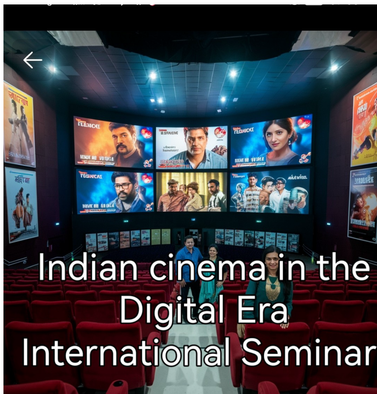
1-AI image created with IDEOGRAM by FLH September 2024

I will speak about discontinuities in the commercial cinema, in student's films with new subjects of films and new ways to treat societal challenges and finally I will analyze the technical revolution that could made this discontinuity happen since 2010, this date could be seen as a turning point in the history of Indian cinema