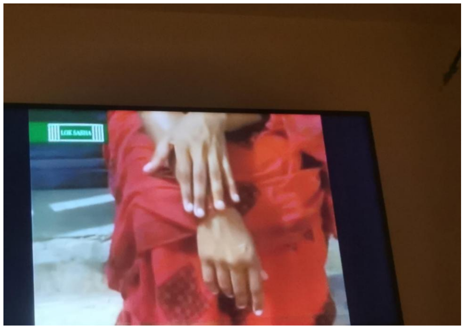
Maya Darpan (1972)