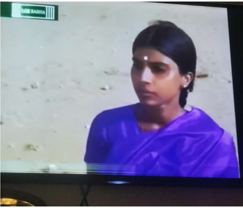
At the Railway

In most of the scenes she is walking and filmed from behind ... In her back side strolling in a white corridor. Her figure in red is wandering around in a slow path manifesting expectation. In other scenes she wears a white saree, orange, and purple (at the railway station) according to the subjectivity of the scene related to her emotions.