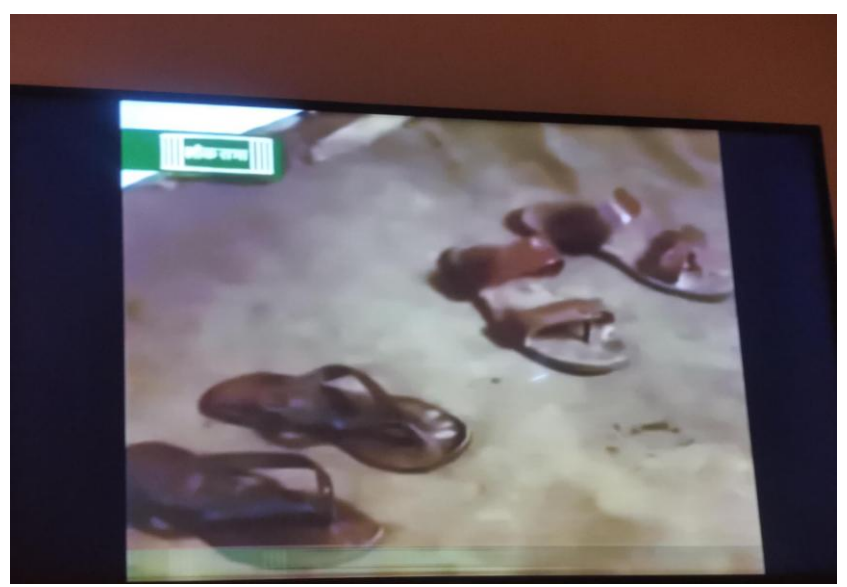
Maya Darpan (1972)

Taran will eventually join him in his construction site. A rough place opposed to her aristocratic house. The way the desire is filmed between the young couple is also very respectful. The freeze-frame of the sandals of the two young lovers on the floor personifies this notion of gender equity. We understand that they are making love together with the sandals on the floor. The shoes are arranged together.... both positioned on the same line. In cinema positions are key expression of your status or situation.