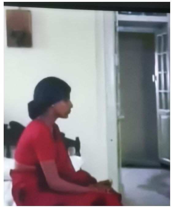
Maya Darpan (1972)

There is a growing intensity of solitariness, and the film starts from a natural boredom to grow with a sense of isolation and seclusion.