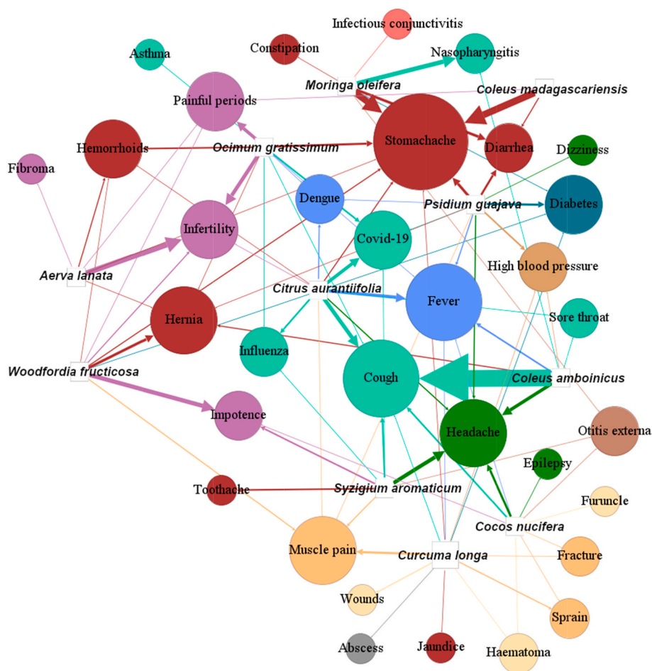
Legend: The width of the link is proportional to the number of participants who mentioned the plant for the treatment of the respective disease. The same principle applies to the size of the nodes.

For the diseases, each color corresponds to a category of the ICPC-3: