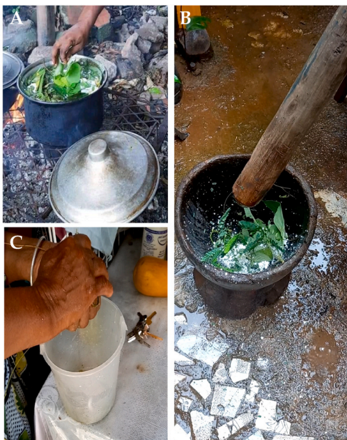
Legend: A. Decoction; B. Crushing the plant with a mortar; C. Crushing the plant in the palm of the hand