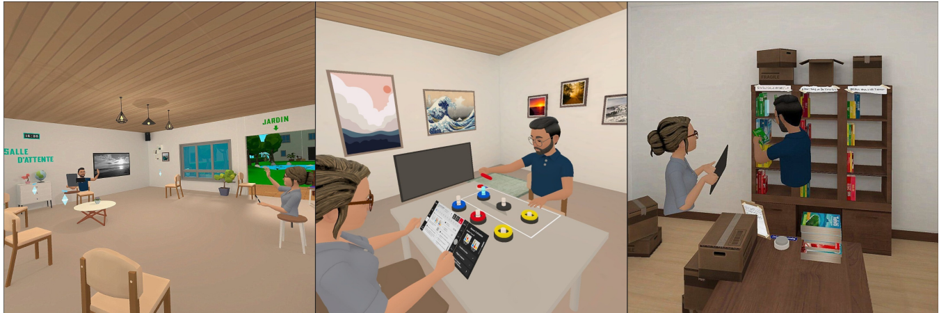
Figure 2: Left : The waiting room and the garden feature several chairs where patients can carry out various waiting activities, such as gardening, respiration, video watching, therapeutical information. When ready, the practitioner teleports into the room to meet the patient (right of the image), before they enter together the consultation room. Middle : The consultation room features a desk where desk-based testing activities can take place (here Tower of London ). The practitioner can monitor the test from the control panel, and a shared screen allow to comment results with patients. The green teleportation mat behind the patient is where he needs to go to teleport to independent testing environments. Right : Independent environment for testing executive functions where the patient has to take books from a pile on the table and put them at the right place in the library. The practitioner is also present in the environment, observing the patient directly and by attending at behavioral indicators on her panel. Video: https://youtu.be/FLZfp1H8gas

4). Acceptability was assessed only after the second session on -3 to +3 scales for the dimensions: Performance Expectancy , Effort Expectancy , Social Influence , Facilitating Conditions , Hedonic Motivation , Behavioral Intention . Scores for patients' point of view are very good: mean > +2 for all dimensions except Performance Expectancy (mean = +1.85) and Social Influence (mean = +1.30).