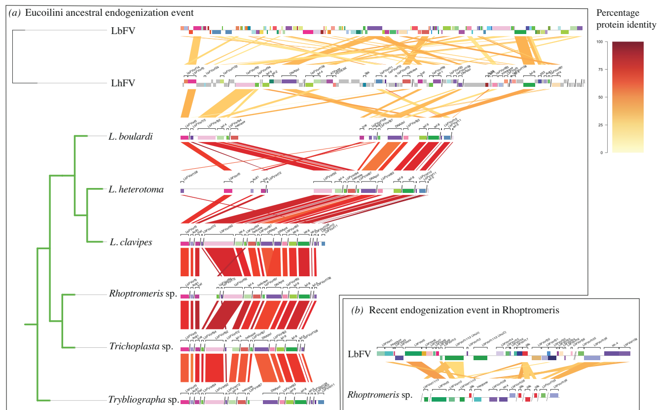
Figure 2. Comparative genomics of wasp scaffolds sharing similarities with filamentous ORFs. (a,b) The phylogenetic tree on the left has been made according to the results from electronic supplementary material, figure S6. Green and black branches correspond to Eucoilini + Trichoplastini and filamentous branches, respectively. The red/yellow colour code depicts the percentage of protein identity between homologous sequence pairs (viral or virally derived loci). Coloured boxes identify the virally derived genes and their orientation (above: sense; below: antisense). The figure has been drawn using the genoPlotR package [35]. The scaffolds are ordered from left to right in an arbitrary manner. LbFV, Leptopilina bouleari Filamentous virus; LhFV, Leptopilina heterotoma Filamentous virus.

Overall, the EVEs identified in the ancestral event were enriched for core viral genes (defined at the level of Naldaviricetes ) with 12 core genes among the 18 EVEs (compared with a putative donor virus such as LhFV with 110 genes and 29 core genes, Fisher test, odd-ratio = 5.5, p -value = 0.001753). These genes are likely involved in cholesterol metabolism, DNA replication and processing, transcription, packaging and assembly, morphogenesis and unknown functions (figure 1). This enrichment in core genes is in line with the data obtained in other cases of viral domestication in parasitoid wasps [9–12] and suggests that core viral functions are crucial for the production of VLPs.