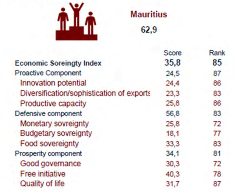
Figure: Key components compared to the World