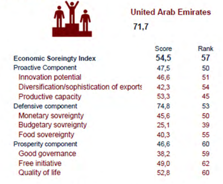
Figure: Key components compared to the World