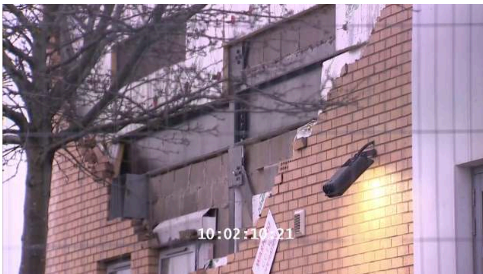
Fig.2. Oxbgangs Primary School, Édimbourg, une des écoles faisant partie de la première vague de PPP signés en 2001 avec le consortium Edinburgh Schools Partnership .

SOURCE : HM TREASURY, PFI : Meeting the investment challenge , July 2003, p. 37.