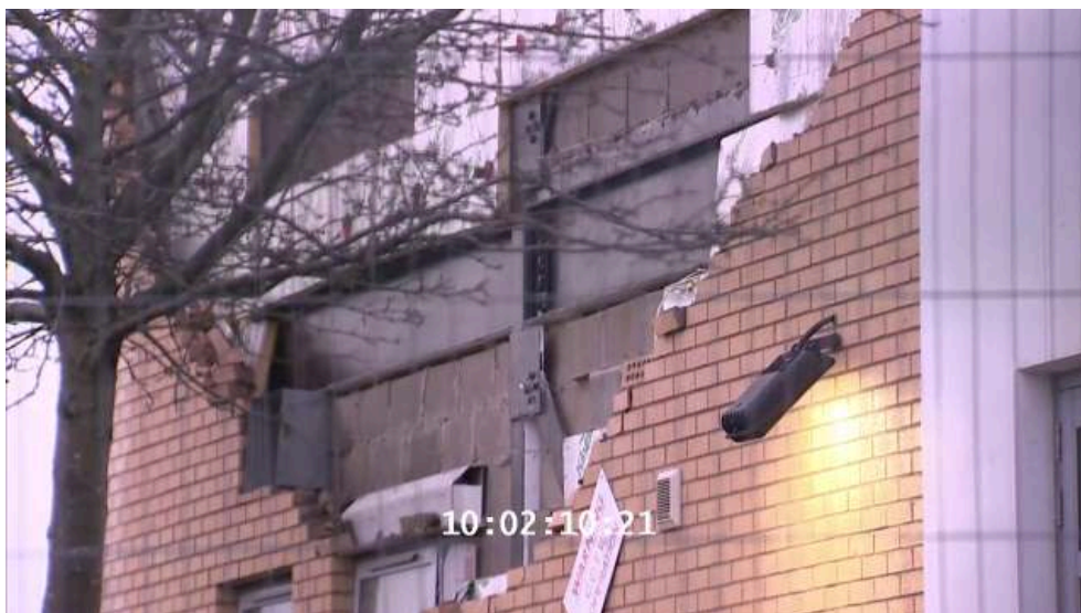
Fig.2. Oxbgangs Primary School, Édimbourg, une des écoles faisant partie de la première vague de PPP signés en 2001 avec le consortium Edinburgh Schools Partnership .

SOURCE : HM TREASURY, PFI : Meeting the investment challenge , July 2003, p. 37.