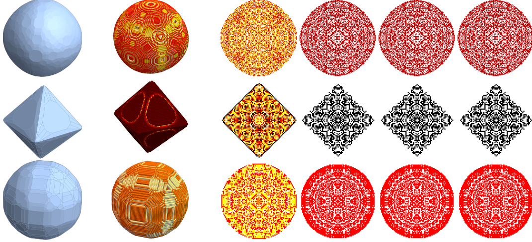
Figure 1: We consider the following sandpile model with four colors. Color 1 sends 1 chip to location (0, 0, 0) to each of the colors 2, 3, 4, m = 4/3 so 1 chip is lost. Color 2 sends 2 chips to color 1, to the locations (0, 0, -1) and (0, 0, 1) , m = 2 , so no chip is lost. Color 3 sends 2 chips to color 1, to the locations (0, -1, 0) and (0, 1, 0) , m = 2 , so no chip is lost. Color 4 sends 2 chips to color 1, to the locations (-1, 0, 0) and (1, 0, 0) , m = 2 , so no chip is lost. For each of the three rows, the leftmost picture shows the convex hull of the final configuration; the second picture shows a unit sphere at each point of the boundary of the visited region, the darker the sphere, the larger the height; the four right pictures show the middle horizontal slice of the final configuration in each of the 4 colors. The first row represents the above sandpile model with initial configuration of 10^{34} chips. The second row represents the same sandpile with the exception that m = 10^8 for color 1, and with initial configuration of 10^{300} chips. The last row represents the same sandpile with the exception that m = 3 for color 1, so it is not a leaky model, and with initial configuration of 10^6 chips.