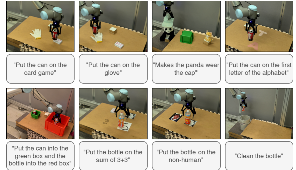
Fig. 3. Different setups and language instructions used in the experiments

As shown in Fig.3, SVLR successfully performed a variety of tasks that required distinct reasoning and decision-making capabilities. The framework can handle complex and indirect requests. For instance, it can process queries such as identifying “the first letter of the alphabet”, calculating “the sum of 3+3”. Furthermore, it executed higher-level commands such as “clean,” which necessitated a combination of reasoning and scene understanding. For instance, the system identified objects needing cleaning (the “bottle”), determined the appropriate cleaning method (“pick and place”), and decided on disposal locations based on contextual information (the “trash can”). SVLR also excels at performing multiple actions in response to a single request. For example, the instruction “Put the can into the green box and the bottle into the red box” results in two “pick and place” actions being generated.