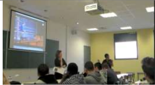
Frame 4: 1mm at the start and the end of his measurement