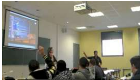
Frame 5: A student tries to speak

The PL (1) discusses Walter Lewin's estimation of 1mm uncertainty for the measurement of the aluminium bar used to calibrate the vertical and horizontal measuring set-ups, suggesting 2mm would be possible too. The English teacher and the students struggle to understand why and respond either with silence (2), a question (3) or a suggestion of 3mm uncertainty (8). The PL says the reason for Walter Lewin's choice is obvious (9) but T does not find this choice obvious (10).