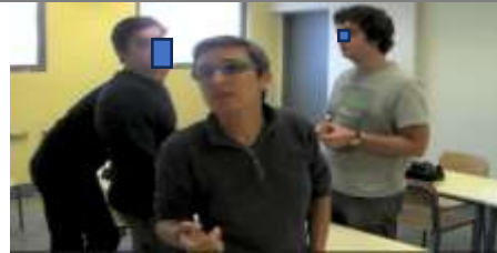
Frame 4: a decimal point

There is some confusion between the students and the PL (13) when PL uses “comma” to refer to the decimal point, the comma being the equivalent of the decimal point in French (12). The English teacher offers the correct term (16), a decimal point.