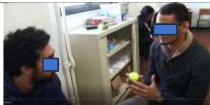
Frame 6: describing the dough method