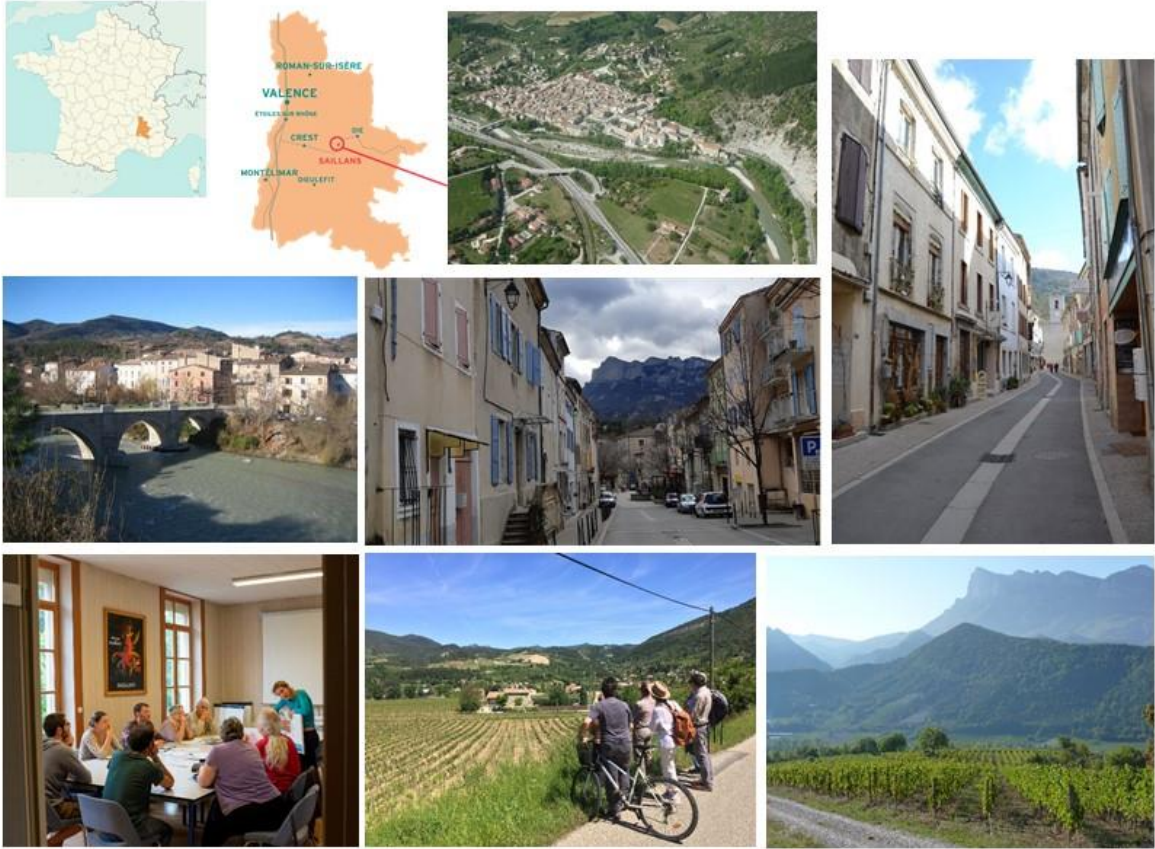
Figure 1- location and views of Saillans

The village of Saillans is located in France, in the Drôme valley. Organized around a well-endowed town center with services and shops, it has a strong associative dynamism, its historically agricultural and industrial economy has shifted in recent decades towards tourism and services. Over the past thirty years, it has experienced a strong demographic increase reaching 1.231 inhabitants in 2014 (+34% in 30 years). Household incomes are generally low, but education levels are higher than the French rural average.