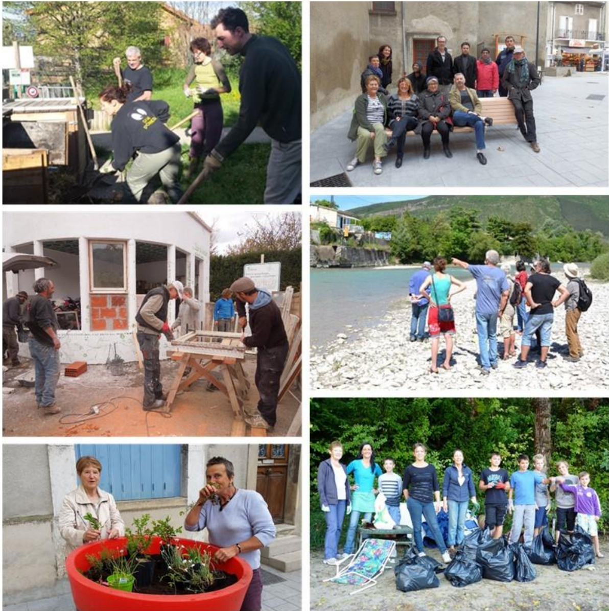
Figure 3 – Examples of Groups Action-Projet

This device allows for a strong amplification of public action. Over the course of the six-year municipal term, 49 different GAPs were held, with the participation of 449 different inhabitants, representing more than a third of the population, of all ages. They each brought together between 6 and 27 people. They resulted in 279 meetings (2792 unitary participations) and many other weekly activities not quantified (such as taking care of composting). The GAPs lasted on average 20 months (10 months median), with great variability: six were punctual (1 meeting), the majority lasted a few months, and eight lasted the entire term. Some activities of these GAPs continue after the change of municipal team, while others have been taken over by local NGOs.