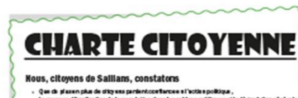
Figure 2 – The model of local democracy of Saillans Municipality 2014-2020 (source: Municipality of Saillans)

It establishes common commitments, encompassing both shared values and the method envisioned to uphold them.