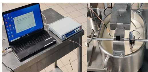
Figure 1 : COAGU'CAPT acquisition system

The technology concerns the development of a milk coagulation sensor, and its on-board electronics (Figure 1) based on a principle of generating a localized, non-propagating acoustic wave.