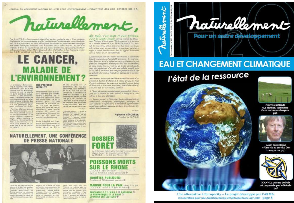
Figure 1. (Left). Front page of the first issue of Naturellement , October 1982. The headlines read (top to bottom and left to right): ‘Cancer, an environmental disease?’, ‘ Naturellement , national press conference’, ‘Dossier on forests’ and ‘Dead fish in the Rhone River’. (Right). The cover of N° 127 of Naturellement . The headline reads: ‘Water and climate change, state of the resource’.

The number of pages published in each issue of Naturellement has increased over time (Table 1). The first issue (October 1982) had 8 pages in black and white, with a bit of green on the first page; N°127 (late 2017–early 2018) had 50 colour pages (Figure 1). The circulation of Naturellement has varied over time; unfortunately, the data archiving system is deficient, which is a common issue in environmental NGOs run by volunteers; a print run of 3000 paper copies was recorded, in addition to a digital version for 5 years.