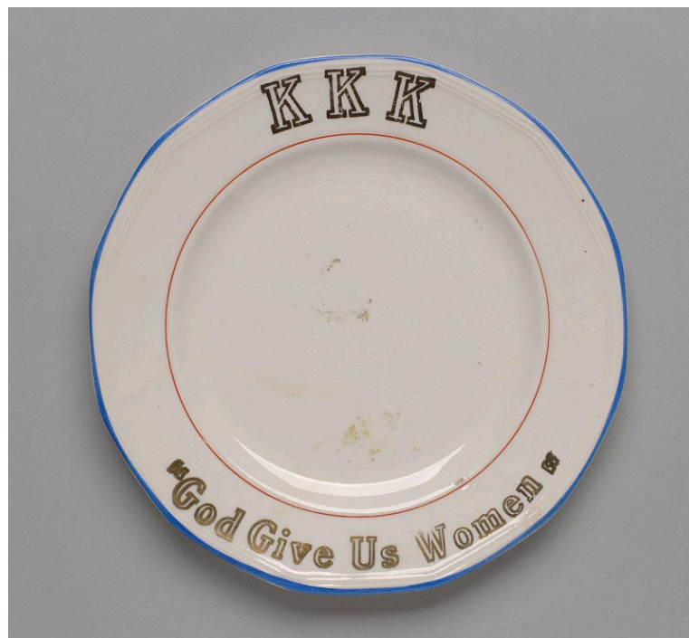
Figure 6: Decorative Ku Klux Klan plate, National Museum of African American History and Culture, Smithsonian Institution

distressing by some. For example, a decorative plate featuring the words “KKK God Give Us Women” (see Figure 6) will be used to facilitate a discussion on the relationship between white women and white supremacy. In-keeping with pedagogical broader approaches of both University of Glasgow and SAWHM outlined above, questions relating to the students’ (dis)comfort will also be provided from the outset of the semester and monitored with immediate response to any negative feedback. While required readings are provided to contextualise the historical relevance of the objects, students are encouraged to volunteer additional reading materials that fosters a more inclusive and autonomous learning environment. Feedback will be sought from students during and at the end of the course, and modifications made in response to their comments and experience.