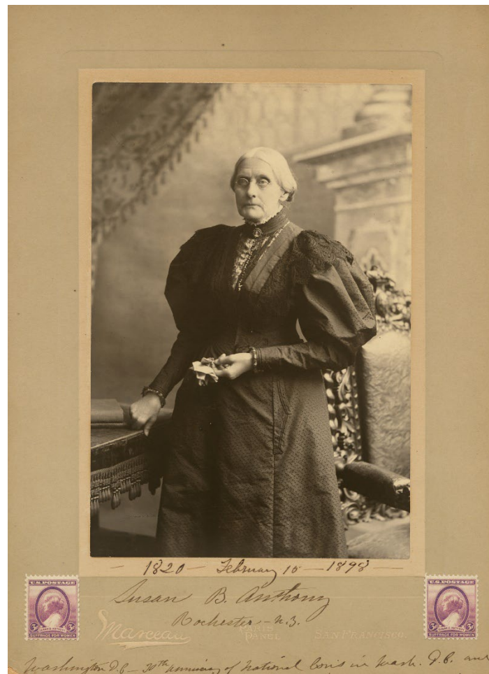
Figure 4: Photograph of Susan B. Anthony, National Portrait Gallery (Smithsonian Institutions)

Additionally, the sheer number of objects in the Smithsonian's collections posed a challenge for course designers. SAWHM educationists originally posed approximately 75 objects across the course's identified themes for consideration. These ranged from portraits of African American civil rights activist and advocate Rev. Dr. Pauli Murray to photographs of attendees at Harlem's Evisu Ball, a queer masquerade, to menstrual pads used by girls of the Quileute people of western Washington state. In some cases, it was decided to select objects representative of individuals as a means to facilitate more nuanced conversations. An example of this is the use of a portrait of labor organizer, suffragist, and feminist Leonora O'Reilly during the course module on Paid Work (Figure 5). While this object centers only one voice, it will be used as a starting point to discuss not only the impact of the 1911 Triangle Shirtwaist Factory fire (which claimed the lives of 123 female garment workers), but also the broader role of women in labor organization, and the contemporary role of women in consumerism and goods production.