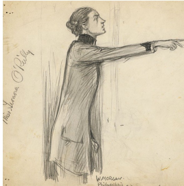
Figure 5: Pencil drawing by Wallace Morgan of Leonora O'Reilly, National Portrait Gallery (Smithsonian Institution)

Finally, the intersectional feminist approach to course design challenged established practice in the subject area and was at times uncomfortable for the Historians on the team: university courses in History are usually developed from an intellectual framing (time period, methodology, scope) but in this case, working back from the collections of the Smithsonian meant ascertaining first what was available and only then defining the intellectual framework. It meant that many resources identified by the Smithsonian collaborators have ended up not being used (at least for the first iteration of the course). It also meant that the scope of the course remained unspecified for part of the project, which could be disorientating for lecturers used to designing courses the other way around. Starting from the Smithsonian collections provided many opportunities for diverse stories to be told, but the gaps in the collection also created obstacles when the team identified themes that were difficult to address through the objects available, a challenge also faced in museum practice.