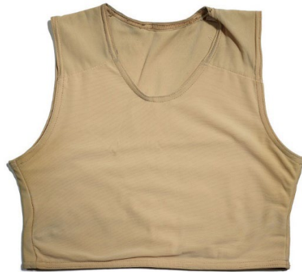
Figure 3: Chest binder worn by professional skateboarder Leo Baker, National Museum of American History (Smithsonian Institution)

With time to survey the collections within the framework of the course curriculum, SAWHM educationists identified compelling objects, including, for example, a chest binder worn by professional skateboarder Leo Baker (Figure 3). Though this object is not currently on view in the National Museum of American History, and will not be used in the University of Glasgow course, digitized images and a 3D model allow learners to observe the chest binder ( https://www.si.edu/object/chest-binder-worn-professional-skateboarder-leo-baker:nmah_1914660 ). With these digital resources, educators gain unique opportunities to facilitate discussions around Baker's experiences as a queer professional athlete and LGBTQ+ experiences, more generally, in sports.