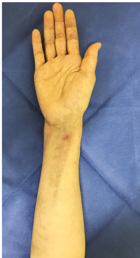
FIGURE 4: Forearm skin state 6 months after the operation. The forearm skin state and surgical wound favorably improved, and she returned to her preinjury job without any problems in daily life.

moisture from the used splint could not be adequately removed, and heat generated by the splint caused blister formation in this patient. Although close examination was performed for suspected contact dermatitis and allergic reactions, no abnormality was detected. Close examination for metal allergy was also performed before surgery to confirm that the implant used in this study could be safely used. During the clinical course of this patient, no aggravation of the skin disorder was observed, and the skin state steadily improved after removal of the physical stimulus.