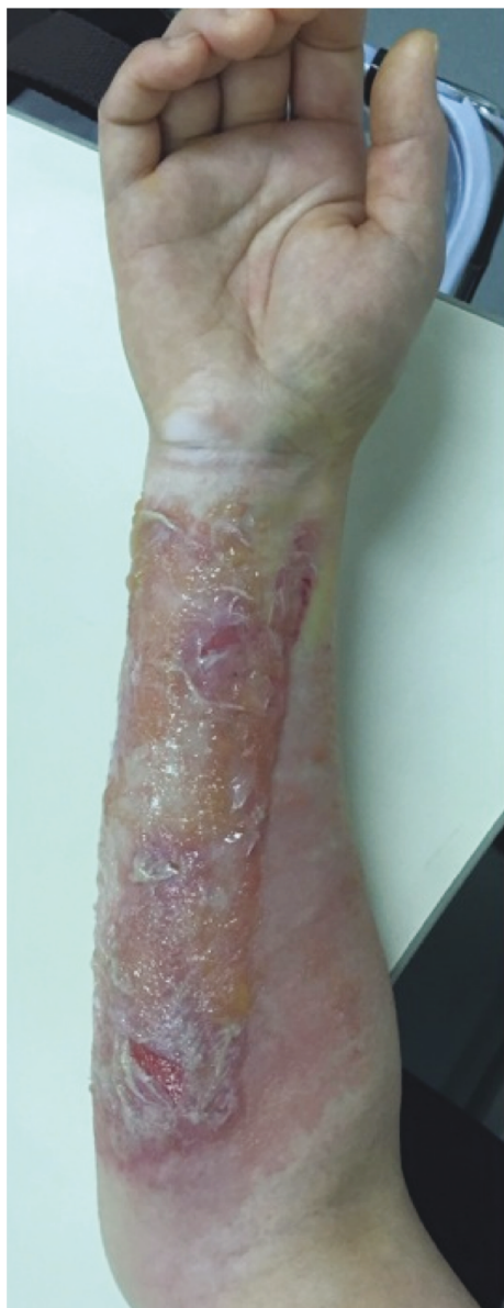
FIGURE 1: The forearm skin state on her visit to our hospital. Skin disorder accompanied by blister formation was observed on the right forearm. The blistering was present along the splint application area.

type A2) (Figures 2(a) and 2(b)). Based on the skin condition, we considered conservative treatment by external fixation using a splint or cast to be difficult, and surgery after improvement of the skin state would be more invasive due to bone union and, therefore, planned minimally invasive locking plate osteosynthesis.