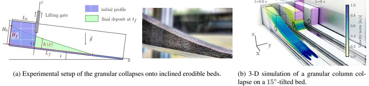
(a) Experimental setup of the granular collapses onto inclined erodible beds.

3 Department of Geography, University of Zurich, CH-8057 Zurich, Switzerland