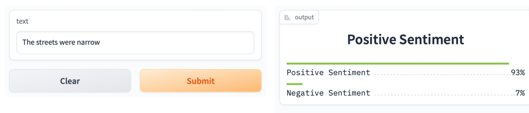
Figure 2. SieBERT-Marrakech usage demonstration ( https://huggingface.co/spaces/Steph974/Marrakech_sentiment_analysis , accessed on 23 April 2024).

SieBERT-Marrakech displays better performance across multiple metrics compared to RoBERTa and DistilBERT. To access the SieBERT-Marrakech model interface, see the Huggingface hub ( https://huggingface.co/spaces/Steph974/Marrakech_sentiment_analysis , accessed on 23 April 2024). The interface allows users to interact with the SieBERT-Marrakech model for sentiment analysis. Users can input text data, such as reviews or comments, into the interface, and the model predicts the sentiment of the input text, classifying it as positive or negative by providing probabilities for each class (Figure 2).