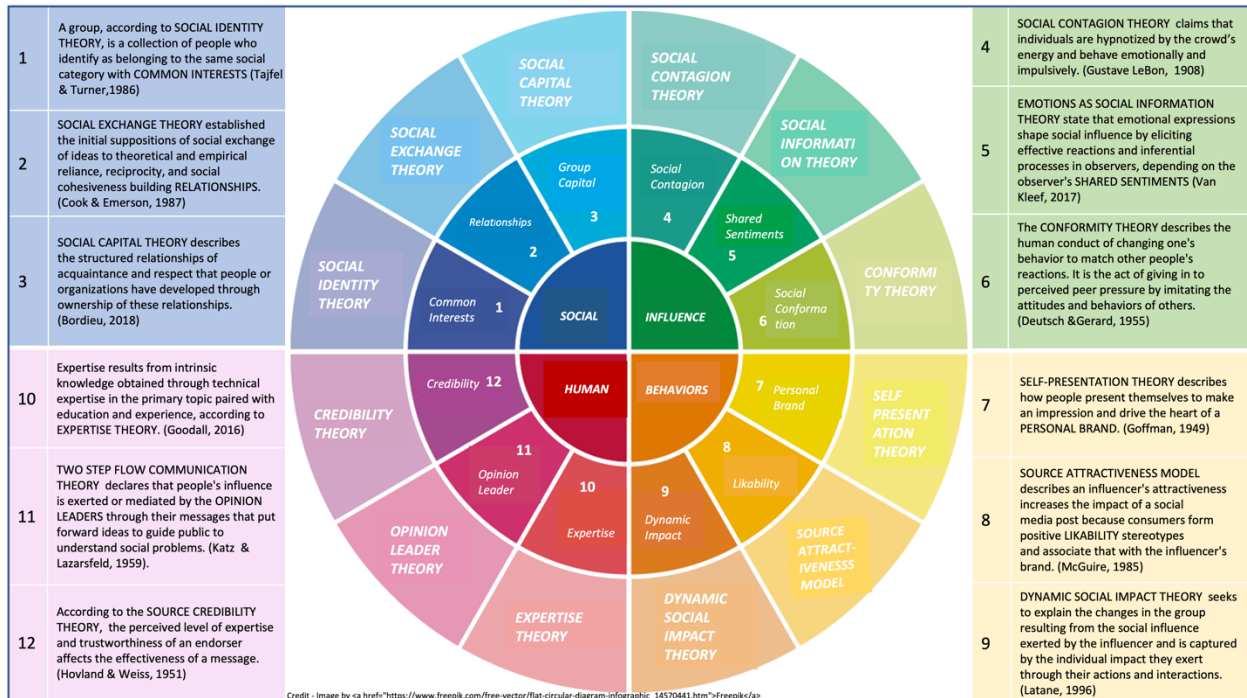
Figure 2 – Social Influence in Online Social Networks: Human Behaviors as Key Influence Factors

The literature review synthesis presents key findings from the 88 shortlisted research articles, categorized under twelve SI factors linked to established psychological theories. This structured approach as shown in Figure 2, provides a comprehensive view of how these behaviors shape and influence interactions within OSNs. By summarizing these critical factors, the review offers clarity on how SI manifests and functions, laying a strong foundation for further analysis and exploration.