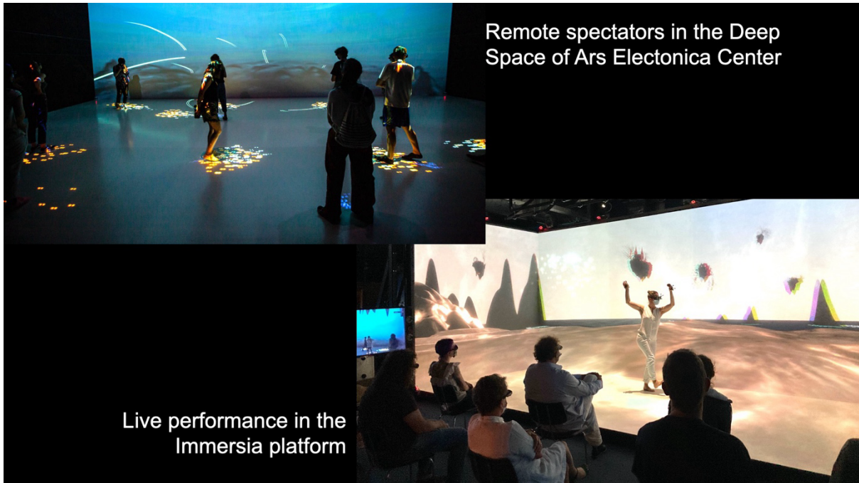
Figure 3: The distant exhibition of Creative Harmony between Ars Electronica Center and the Immersia platform