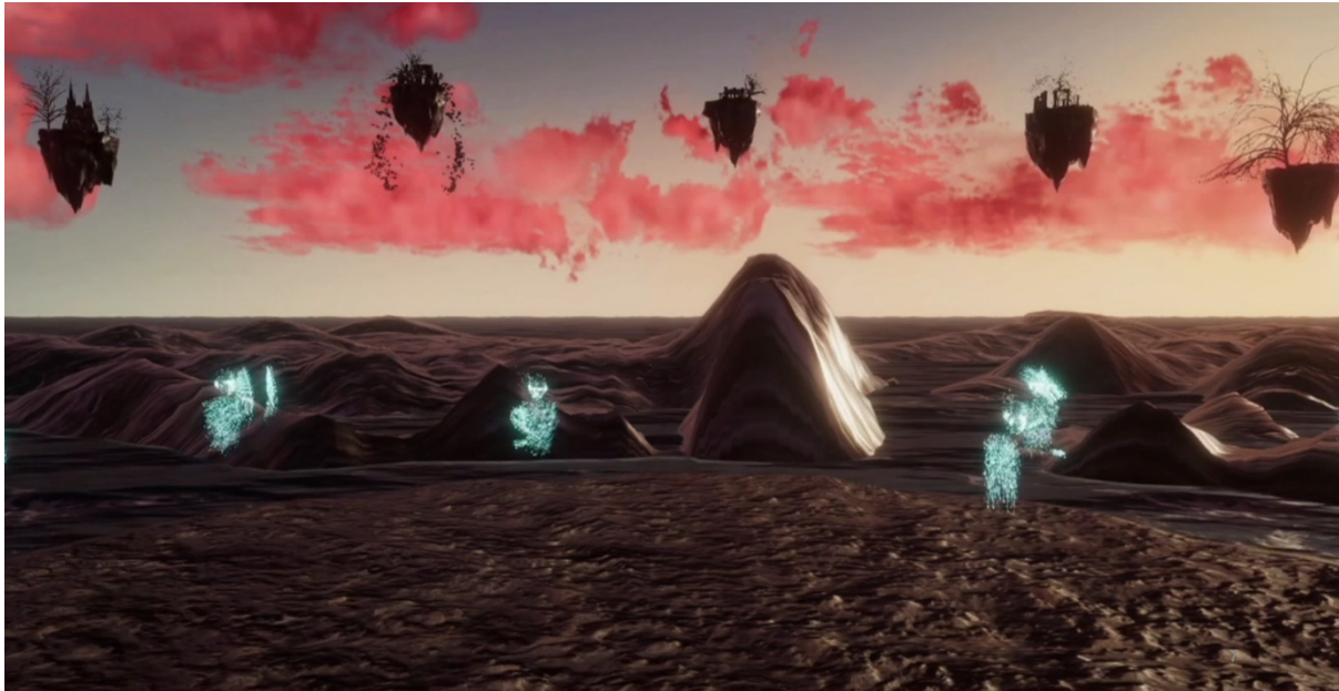
Figure 2: The co-creation scene in the Creative Harmony experience

One originality of the “CH” experience is the exploration of the relaxation of the spectators. We propose to explore this complex state of emotion through the analysis of the “CH” experience. A first user study was conducted to measure the impact on mood resulting from immersion and interactivity, taking into account the collaboration, the curiosity of creation, the involvement of the spectator in the interactive process and the contemplation of the resulting virtual environment. We evaluated the impact of the artistic virtual experience on users’ emotional state before and after their performance in virtual reality. We proposed a method based on a cognitive approach to evaluate this impact, with a standard tool widely used in psychological studies, the BMIS scale. The study of these results highlighted a significant impact on the emotional state of the participants with increase of positive mood indicators and decrease of negative ones, with the highest evolution for tiredness, nervousness, calmness and happiness [2].