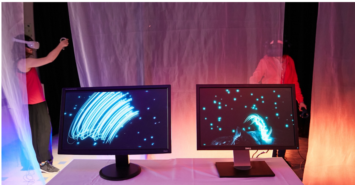
Figure 4: Creative Harmony for two spectators in the Recto VRso festival

Current research and developments of the “CH” environment are considering and investigating three main directions: