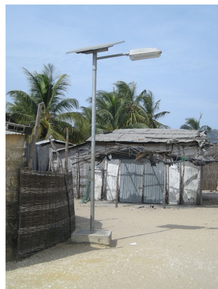
Fig. 2. Typical photovoltaic solar public lighting (Elinkine, Casamance, Senegal), CC license, public domain, (source: Wikipedia) [9]

This case study focuses on the use of solar photovoltaic streetlights for public lighting in areas of Tunisia where the national power grid does not reach all roads. Solar photovoltaic streetlights provide a viable solution to this challenge, especially in rural regions, but their effectiveness is closely tied to the energy storage systems that power them during nighttime hours (Fig. 2).