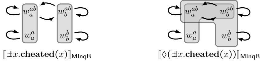
Figure 1: Illustration of the semantics of (4-b) in MInqB. Arrows represent the accessibility relation R_\mu .

The alternatives of the prejacent \varphi are projected to \diamond\varphi by mediation of R_\mu^{-1} . If the accessibility relation R_\mu is an equivalence relation, R_\mu^{-1}(s) contains s . Hence, output resolving proposition s is wider than prejacent resolving proposition s' . This widening is what weakens the question. 1